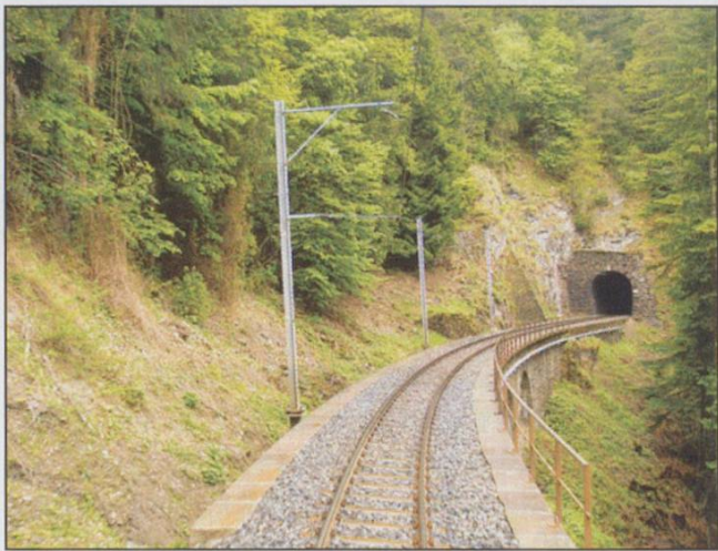
Just some of the many trees that line the track in the gorge between Thusis & Solis.

Having set out just to do some bird watching we had used six trains, two boats and covered a sizeable chunk of Switzerland with an ease only achieved with the Swiss Pass and the estimable national timetable that allowed last minute changes of plan to be made – impossible to do in this country.