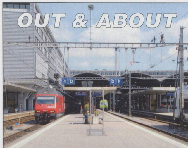
A Sunny Day at Luzern HBf.