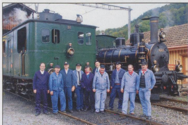
The four GWS members pose with their Swiss compatriots, the visitors being 1st 2nd 4th & 5th from the left.