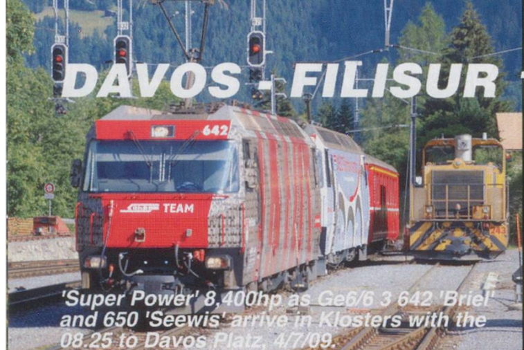
'Super Power' 8,400hp as Ge6/6 3 642 'Briel' and 650 'Seewis' arrive in Klosters with the 08.25 to Davos Platz, 4/7/09.