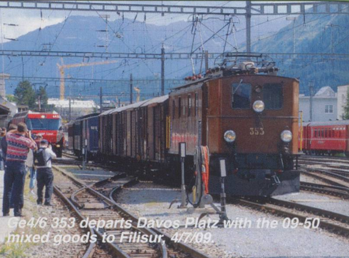
Ge4/6 353 departs Davos Platz with the 09-50 mixed goods to Filisur, 4/7/09.

The Jubilaeumfest to celebrate the 100th anniversary of the RhB's Davos to Filisur occurred over the weekend of June 4th and 5th 2009. Thanks to the STO website I was able to arrange a competitive package in the Davos 'Hotel Sport' that had the advantage of having a free Railover ticket for all journeys between Klosters and Filisur as well as all mountain transport in the Davos/ Klosters area.