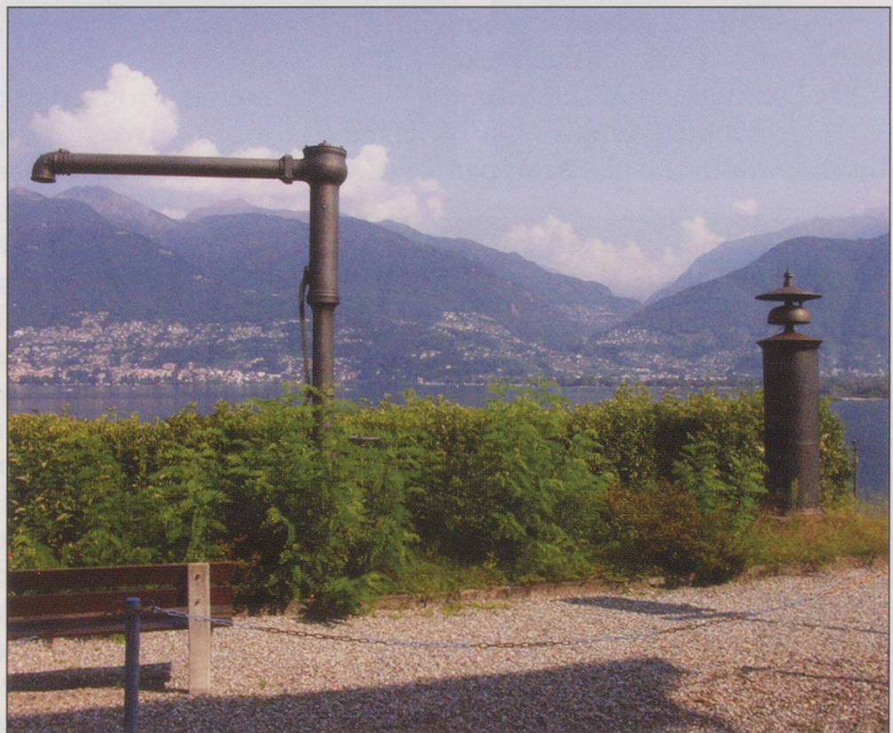
MIDDLE: Setra postbus at Cadenazzo, on the lakeside service from Dirinella to San Antonino. BOTTOM: Heritage railway furniture at Magadino-Vira, with Locarno in the background.