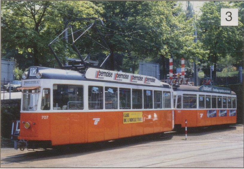
TPG trailer 309 + bogie car 711 Place Neuve, Geneva, 3.1984. TPG, the very new prototype articulated tram 741 plus bogie cars including 706 & 702 in Jonction depot, Geneva, 3.1984. TPG bogie car 707 + ex-Luzern trailer 323 Carouge, Geneva, 5.1985.