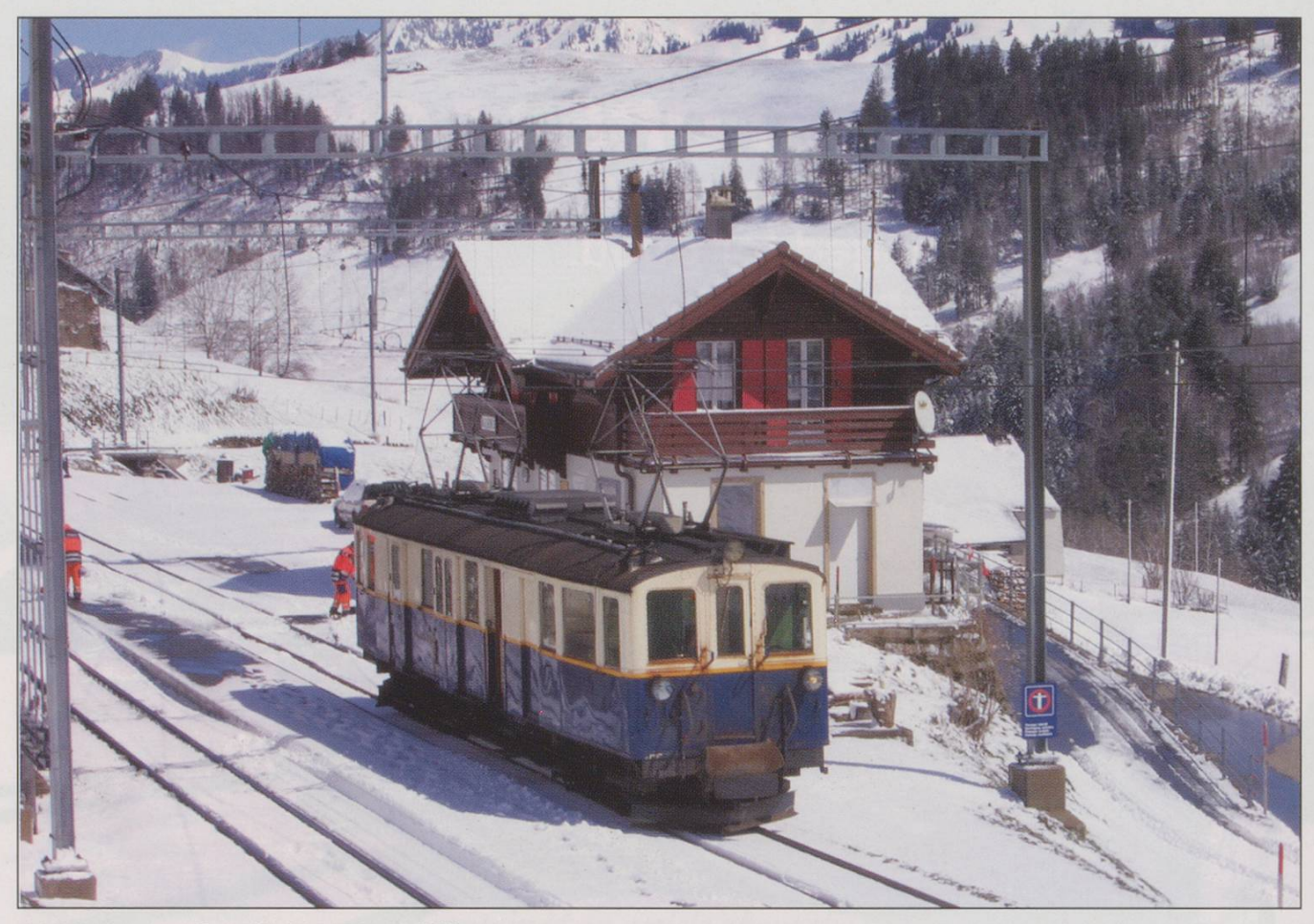
1924 vintage De 4/4 No. 28 at Allières.

have taken a shot of No.1003 crossing the viaduct. In general I was pleased with the amount of traditional MOB blue and white on show, with the 4000-series units hauling blue coaches – though not on as many trains as I would have liked. I enjoyed not seeing too many modern