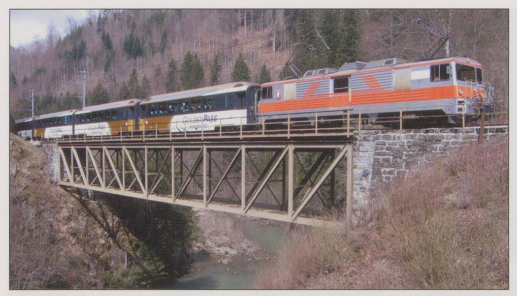
Ex-GFM (TPF) liveriedGDe 4/4 on "Golden Pass Express" duties.

overhead paraphernalia is much more obtrusive than the dark wooden posts, so the new masts dominate in photos with the wooden posts not showing up so well.