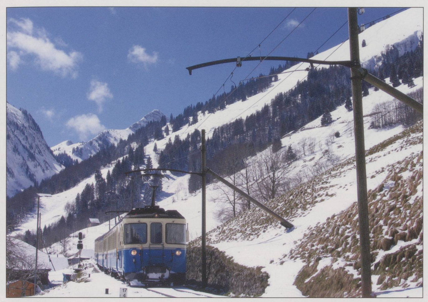
A few remaining wooden overhead poles.

running the Zweisimmen – Saanen school services. Call me boring but I don't like some of the new rolling stock designs or some of the "jumbled up" liveries.