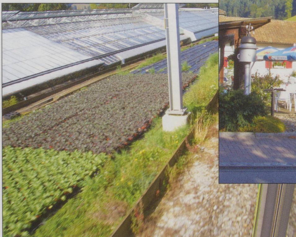
8. Langnau. Part of the re-aligned track formation that is now in use for plants, 9/2007.

railway equipment to be found in places other than on the network or in museums. A hotel garden adjacent to the station in the town of Trubschachen contains a selection of well-preserved railway equipment (Photo 9). The town is also home to the well known 'Kambly' range of biscuits and the factory contains a shop open to the public ( www.kambly.ch ). Finally, should you too