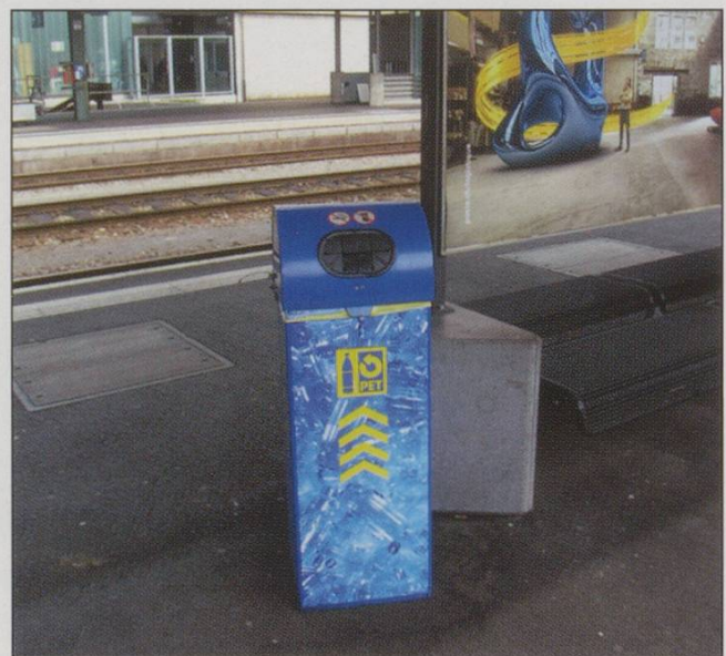
1. Lausanne. PET recycling bins are located at most stations, 9/2009.

decline of freight facilities at local stations. This is something that I touched upon in an earlier article ("Not only trains" – SE 100) and, for example, can already be seen at Worb SBB station, where the traditional staffed station has been replaced by unmanned, cheaper to maintain, facilities. (Photo 2a) Today most travel to and from Worb is via the modern Worb Dorf Station