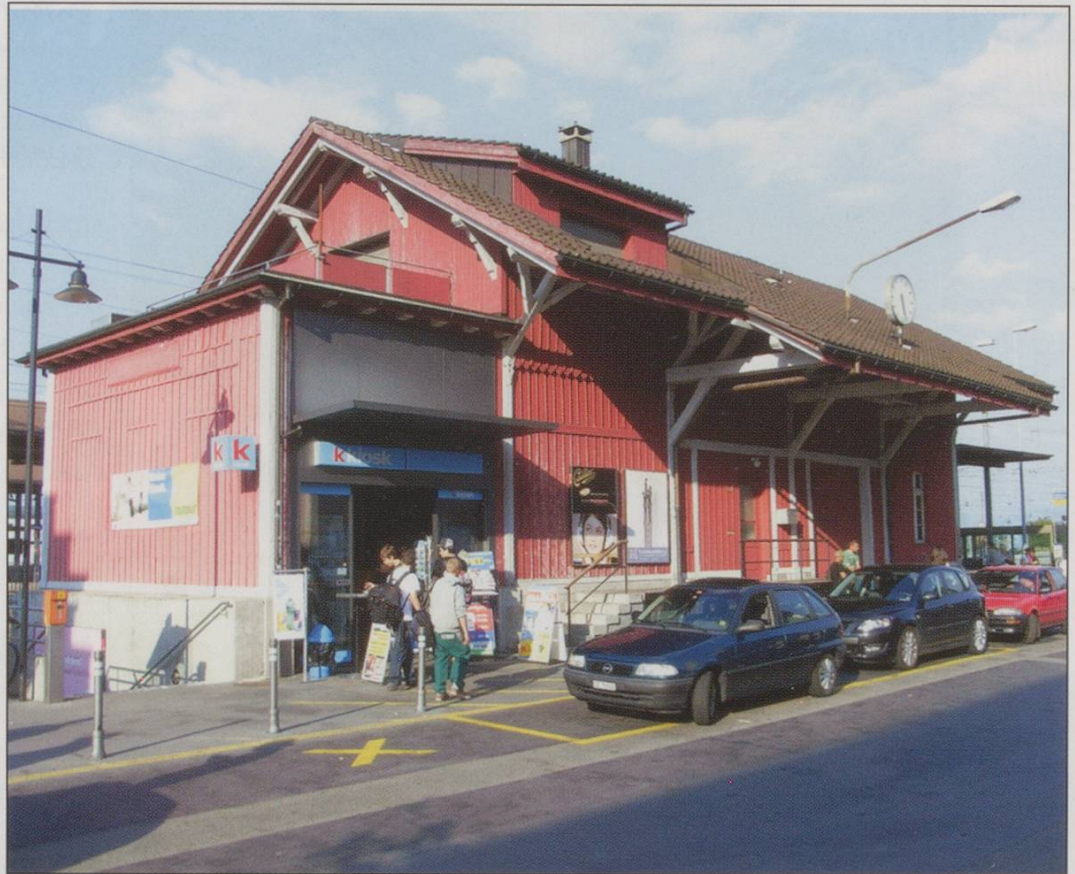
5b. At Pfaffkion a 'Kiosk' outlet now occupies part of the former freight shed, 9/2009.

drainage capability and, although gaining access to and working within this area could be potentially hazardous, this could safely be arranged between train movements given the more relaxed Swiss attitude to H & S issues.