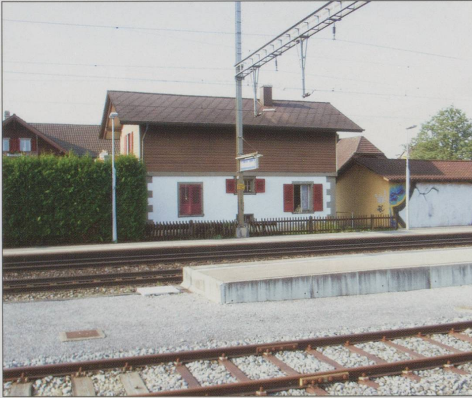
4. Hindelbank. The unmistakable shape of a signal box now converted to a private residence, 9/2008.

helped to give new life to some disused railway buildings as ‘Velo Stations’ for the hire and return of bicycles. The former freight shed at Murten allows cycle hirers the opportunity to sample a largely rural, flat landscape while the ‘Velo Station’ at Airolo freight shed caters for a more energetic clientele wishing to tackle the challenges of the Gotthard landscape (Photo 5a). Re-use for some type of retail operation such as the ‘open-all-hours’ type of shop, run by the