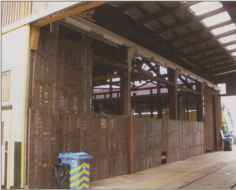
7. Yverdon Works. A windbreak incorporates wooden planks recovered from scrapped wagons, 9/2005.

feel the need during your next visit to Switzerland to make a small contribution to the recycling movement, then you could consider the purchase of a green 'CARGOborsa' bag, manufactured using canvas recovered from scrapped freight wagons and available from either the SBB 'on-line-shop' ( www.sbbshop.com ),