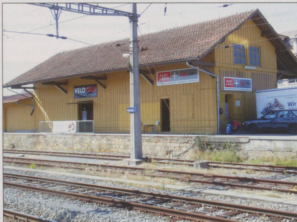
recovered from scrapped freight wagons. This type of ‘internal’ recycling ensures that the railway company largely avoids costs normally associated with the purchase or rent of a new building from the commercial market by keeping the project entirely ‘in-house’. During the ‘Gotthard 150’ event at 5a. Murten. This freight shed now acts as a ‘Velo Station’ for tourists and visitors, 9/2009.

Swiss railway operators, like those the world over, erected a myriad of huts and other small buildings alongside their lines, at freight yards or in their works areas. Many of these are of an all-wood construction, having been built from wooden sleepers or planks