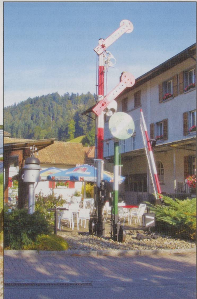
9. A hotel at Trubschachen displays redundant equipment in its garden, 9/2007.