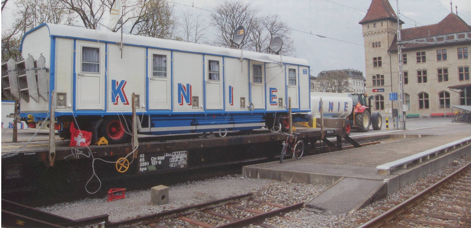
Accommodation trailer with five individual "rooms" for staff, performers, etc. Behind is a circus tractor with a road tank-trailer.

All were at Glarus in April 2010