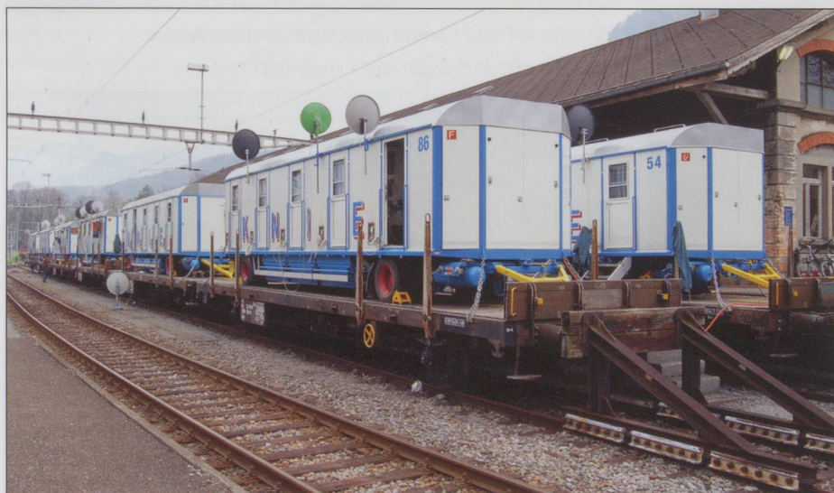
All the accommodation trailers on their flat wagons parked-up in the freight yard.

use 53 wagons, which carry around 100 circus trailers, in two trains. This may vary if the next destination is close, when more vehicles go by road. With the "Tierschutz" legislation regarding the transport of animals the elephants, horses, camels, zebras, llamas, ponies and long horned Watusi cattle now travel by road. There no longer is the spectacle of elephants going into domed roof trailers, or giraffes crouching down to slide into their trailers. The Am843 was the resident loco at Ziegelbrücke, where the Linthal branch joins the network, and had been brought up to Glarus for the weekend; Tm 8756 had simply appeared from Netstal further down the valley, where it is used to shunt wagons for the stone and gravel quarry there; whilst the Re 4/4 was the dedicated circus train engine.