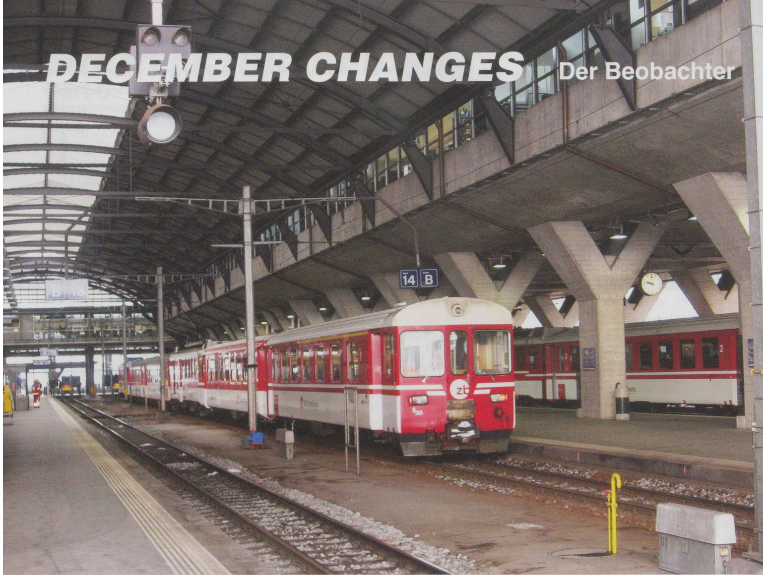
A former LSE Unit awaits departure for Engelberg at Luzern.