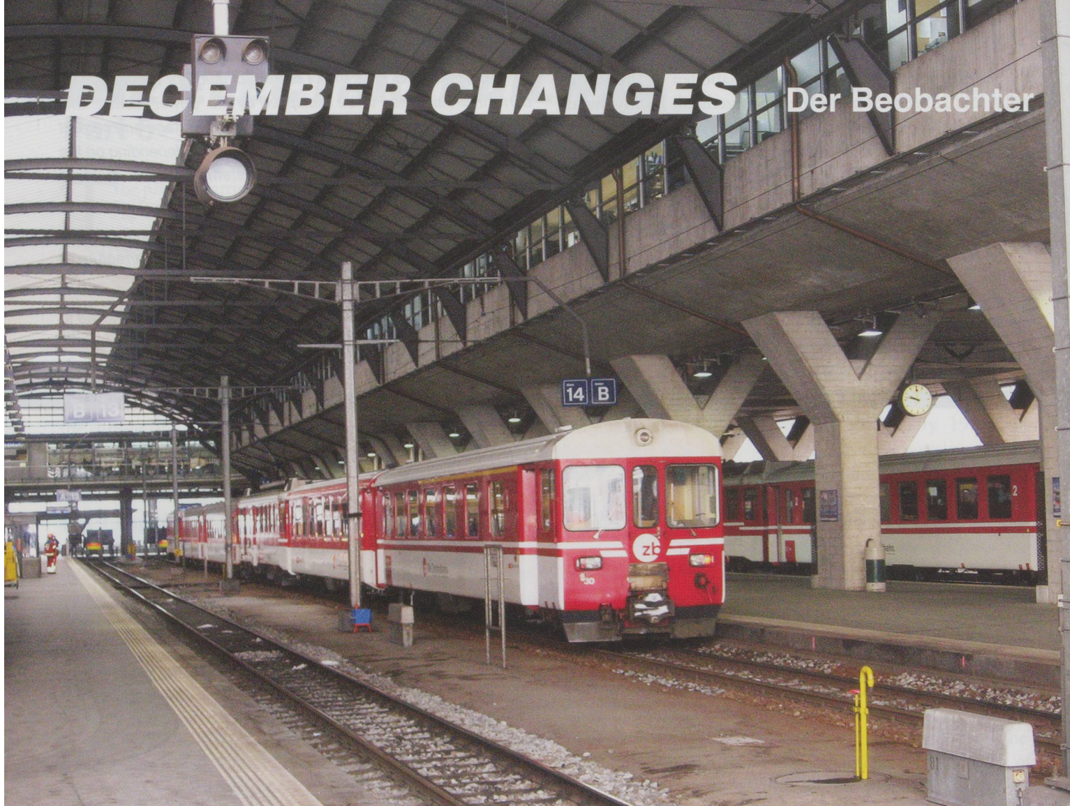
A former LSE Unit awaits departure for Engelberg at Luzern.