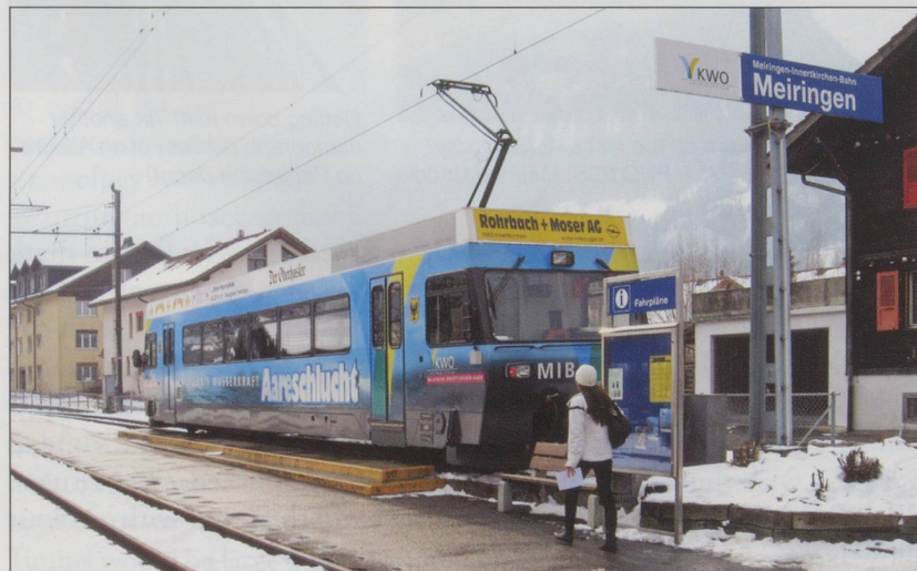
The old MIB terminus at Meiringen. The connection to the ZB station is in the foreground.

claimed 1 minute connection time to ZB trains and PostAutos. The connection time between the ZB and the old MIB terminus 300m distant was always optimistically quoted at 4 minutes, but most people never believed it. You had to know the exact location of the MIB platform, then it was a fast walk in all weathers including crossing a sometimes busy road. The reason was that the MIB was never built as a passenger railway, but as an industrial line to serve the power station in Innertkirchen, and its siding out of Meiringen yard was originally adequate. That was no longer the case; a half-hourly service on the MIB, together with active marketing of