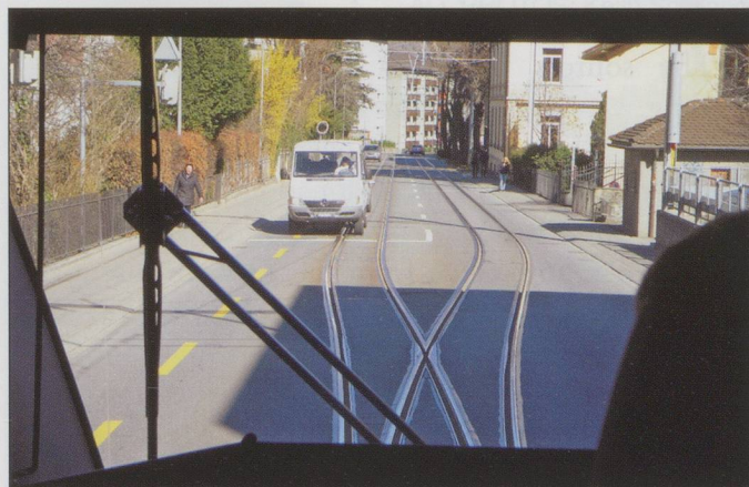
The view from the front of a 3,000 hp train – honest! 09.48 Arosa – Chur, 14/03/2011.

were Allegras. From the passenger's viewpoint they are excellent and I rapidly grew to appreciate them. Just as well really, because on Monday it was another down to Chur and, after the usual loco-hauled train from Chur to Filisur (Ge 4/4 III No. 651 Fideris - for the third time this trip) I got out for the Davos connection to find another Allegra waiting. Again, the view from the front was spectacular allowing real appreciation of the engineering that had also gone into this route.