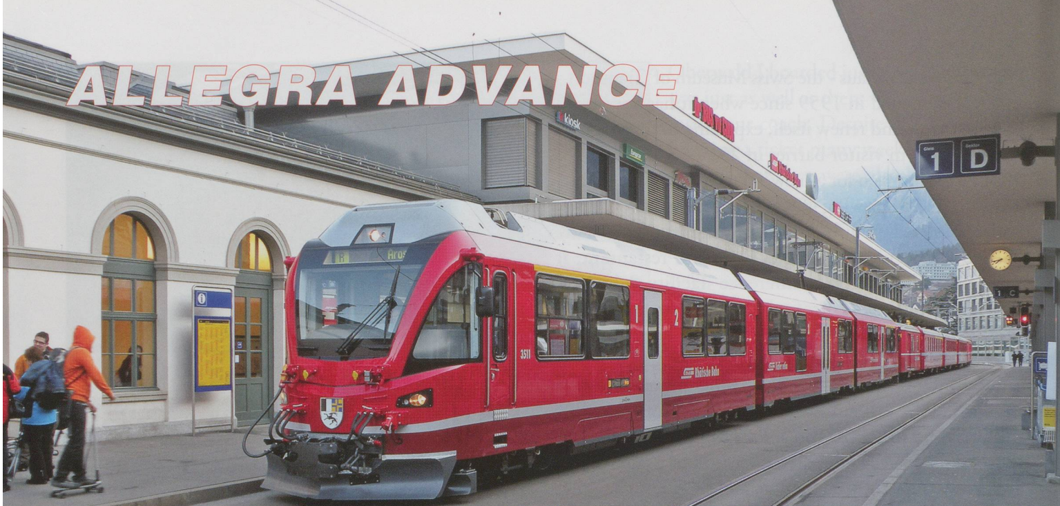
ABOVE: The Allegras are here. The 08.08 Chur to Arosa, 11/03/2011.