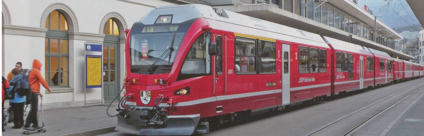
ABOVE: The Allegras are here. The 08.08 Chur to Arosa, 11/03/2011.