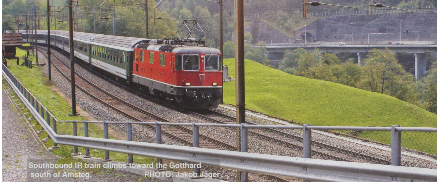
Southbound IR train climbs toward the Gotthard south of Amsteg.