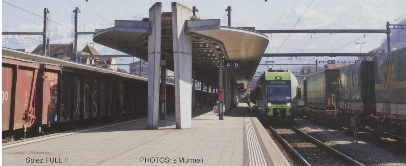
Spiez FULL !!