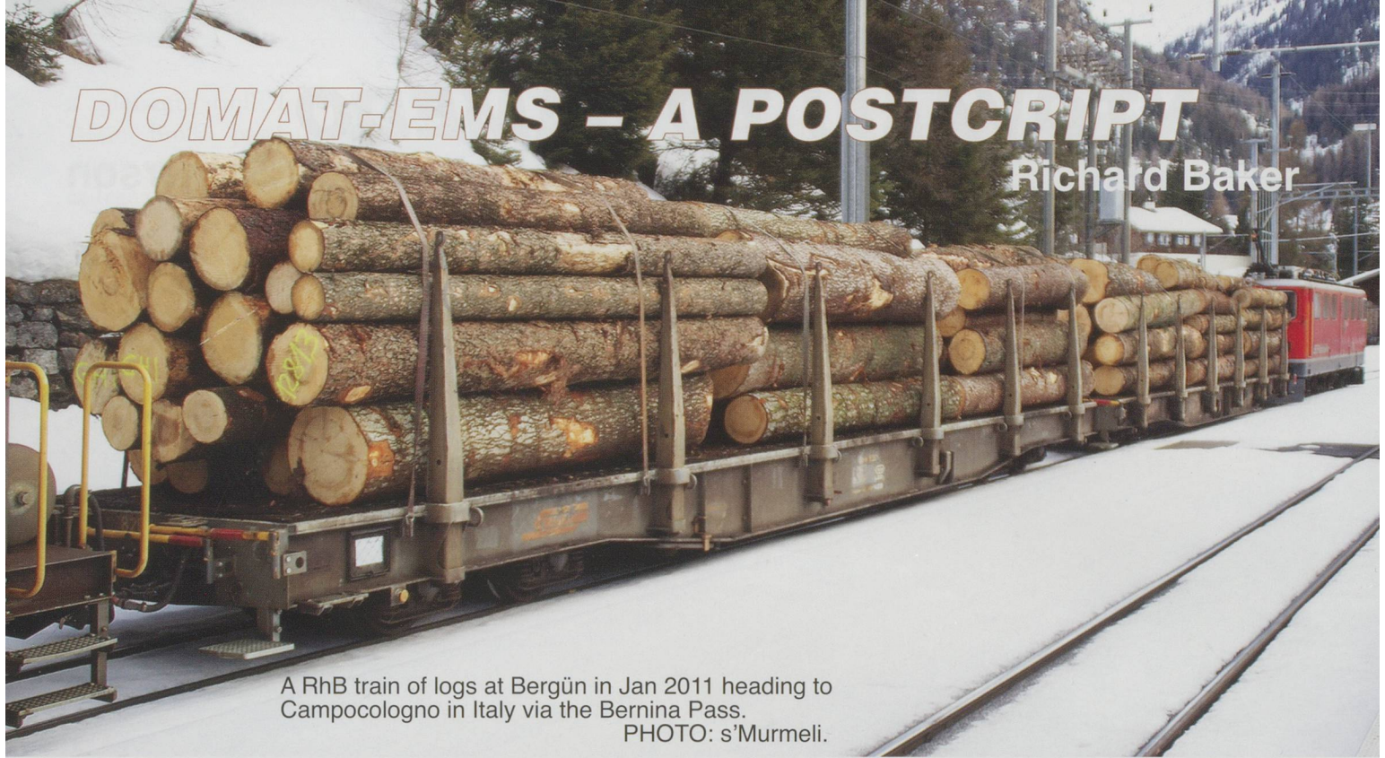
A RhB train of logs at Bergün in Jan 2011 heading to Campocologno in Italy via the Bernina Pass.

In the March 2011 edition of Swiss Express I was concerned to read that the extensive rail-served timber processing plant at Domat-Ems outside Chur had ceased to operate due to bankruptcy. I had first become aware of this operation in 2008, both from seeing it from an RhB train en-route to Filisur, and then reading a magazine article about the investment made by the Swiss subsidiary of the Austrian Stallinger Group. With an expected throughput of some 600,000 cubic metres of wood per year, this was predicted to be a great opportunity locally for both the RhB and the SBB. Not only had there been CHF15m spent on a dual-gauge rail connection to the adjacent lines, but Canton Graubünden had pumped substantial public funds into the development. It was also agreed between SBB/RhB that the former would allocate an Am 843 diesel loco to work the incoming loads of timber “in-the-round” and the outgoing products. Additionally the RhB had apparently ordered ten new wagons (Sgp 7601 – 7610) which, with their double vertical supports, would be very suitable to handle the incoming timber. However, even shortly after the opening of the plant, it was being reported that levels of wood movements were not as great as had been expected, perhaps being affected by the import of cheaper raw material from places like Germany.