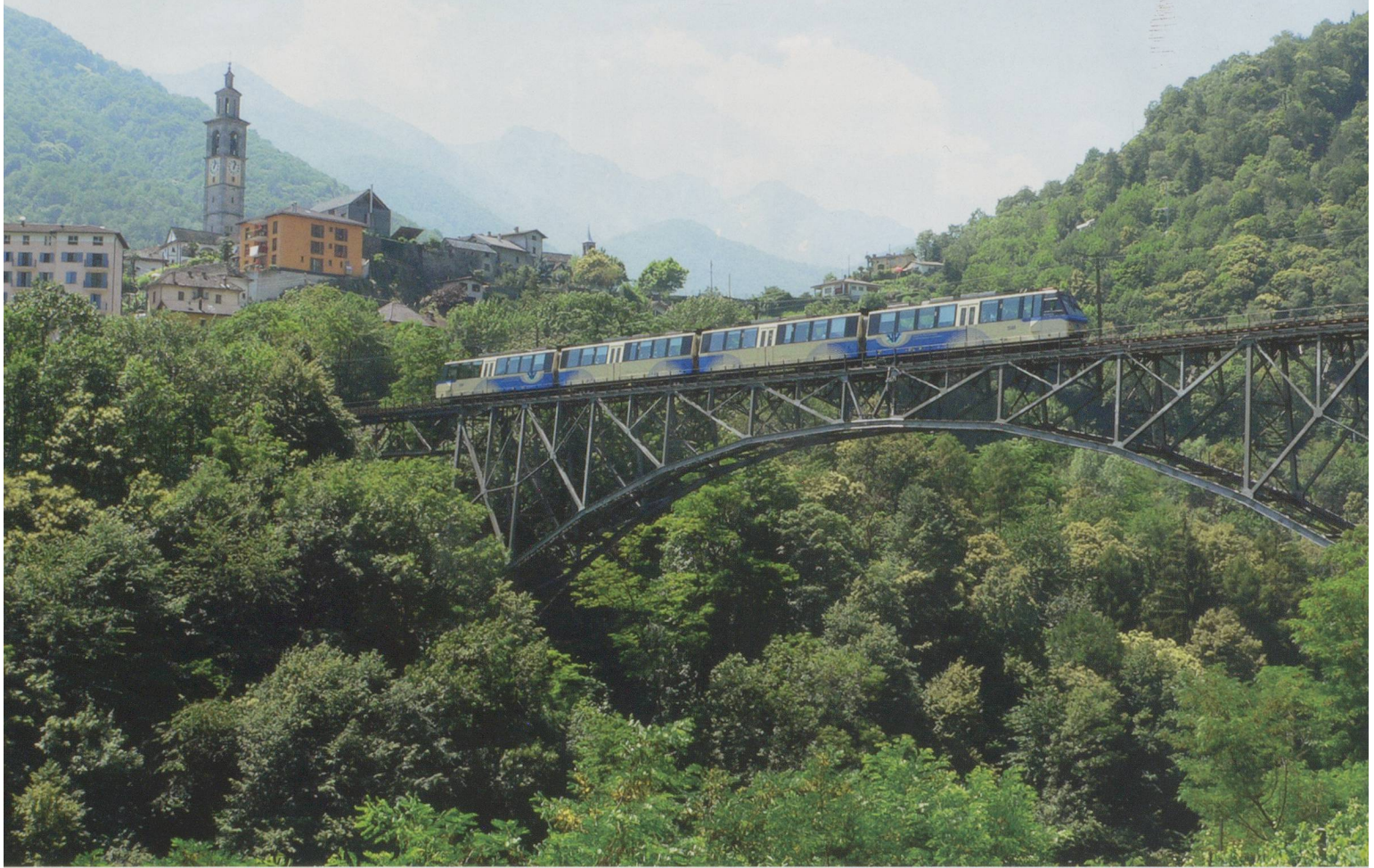
Intragna and the bridge across River Isorno with an ABPe 12/16 unit crossing.