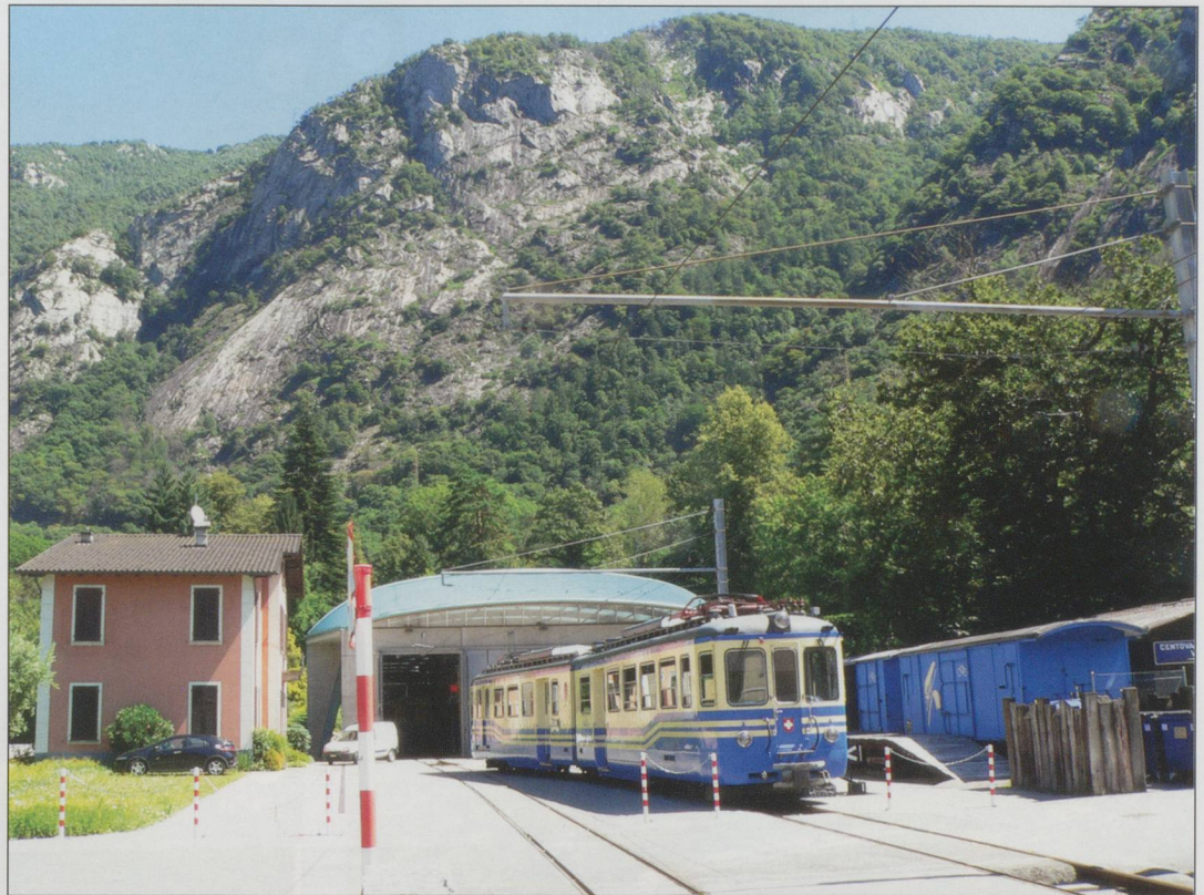
ABOVE: An Abe6/6 at Ponte Brolla depot.

a pleasant stroll from Ponte Brolla past the church to the next station at Tegna. The train climbs steadily up the valley and through the wooded countryside. Many of the trees are Sweet Chestnut and Robinia giving the valley an unique appearance. At Intragna the train crosses the River Isorno via a superb viaduct parallel to the road before entering the station. Palm trees stand by Verdasio station where there is one of the region's cable cars up to Rasa. At Palegnedra a dam has created a huge reservoir that stretches back to Camedo. The reservoir is crossed by