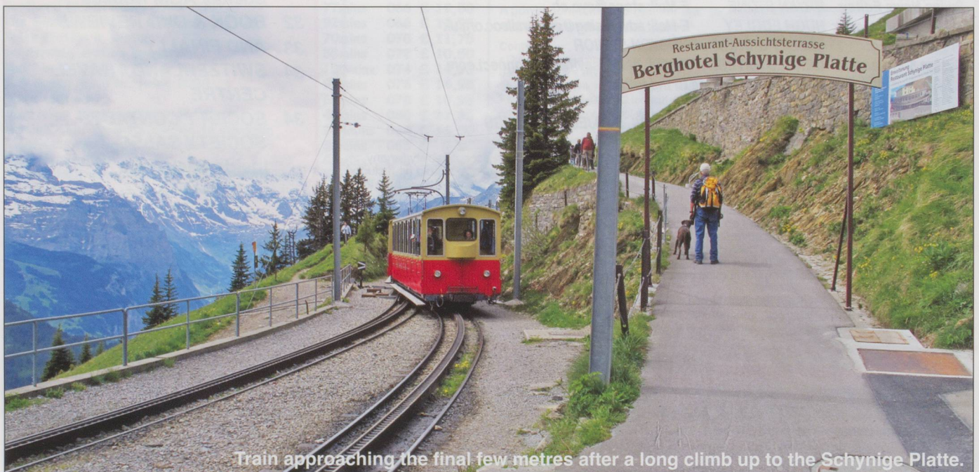
Train approaching the final few metres after a long climb up to the Schynige Platte.

The SPB is a single track 800 mm gauge line that uses the Riggibach rack system to climb 1,420 m to the summit, in a distance of 7.3km at a maximum 25% (1 in 4) gradient. Amazingly, to me anyway, the track was laid and the railway opened in June 1893 after just two years' work, only to be saved from bankruptcy when it was acquired by the Berner Oberland Bahn (BOB) in January 1895. It was worked by steam until 1914 when, like the BOB, it was electrified at 1,500V d.c. The SPB is only open from around May to mid-October and, to stop heavy snow damaging the overhead power cables, a maintenance crew using its 1894 steam rack loco H2/3 No 5 (Photo P.19) takes them down, reinstalling