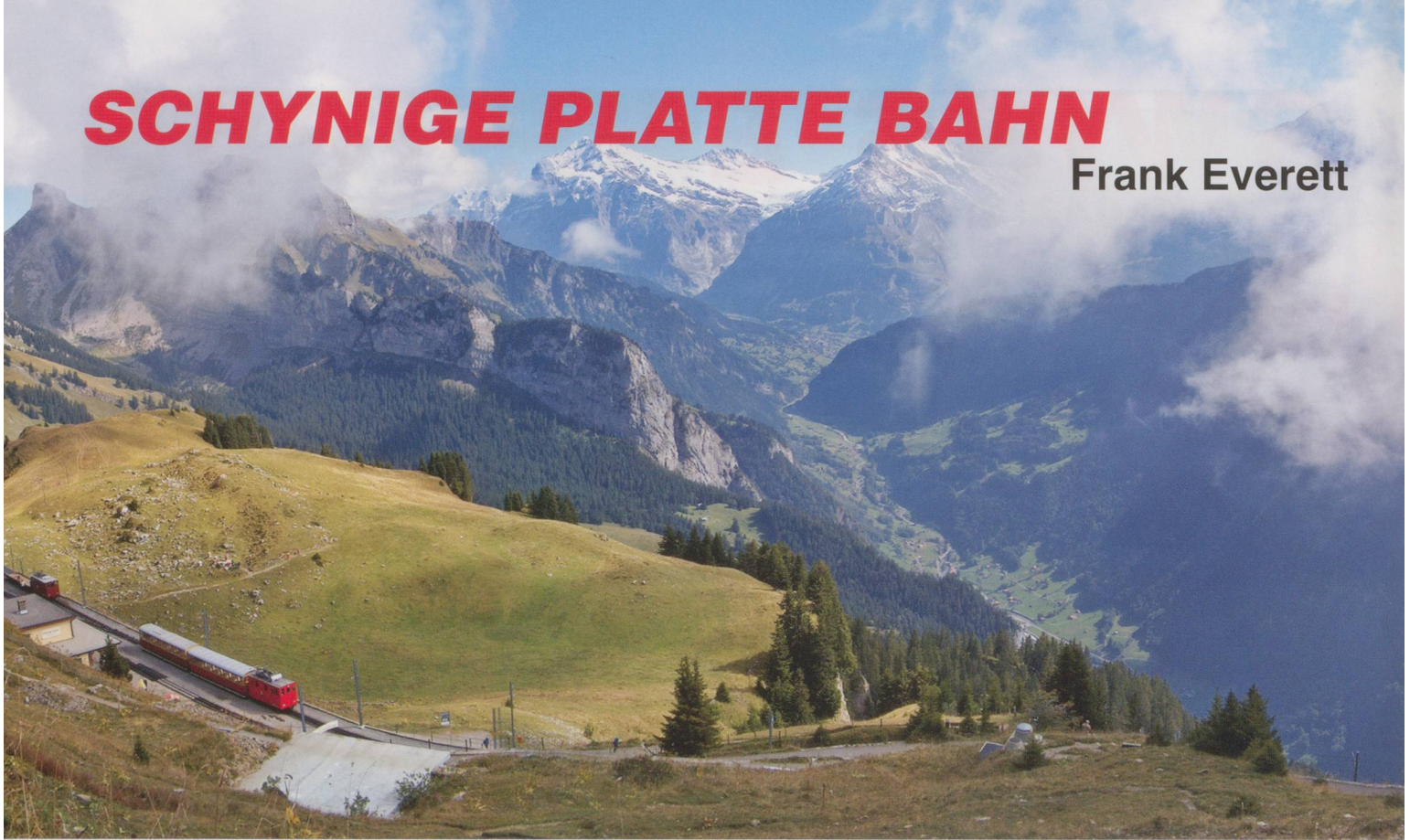
Schynige Platte Bahn top station and view down the valley leading to Lauterbrunnen in September 2008.