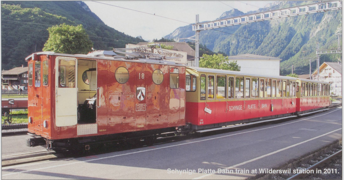
Schynige Platte Bahn train at Wilderswil station in 2011.