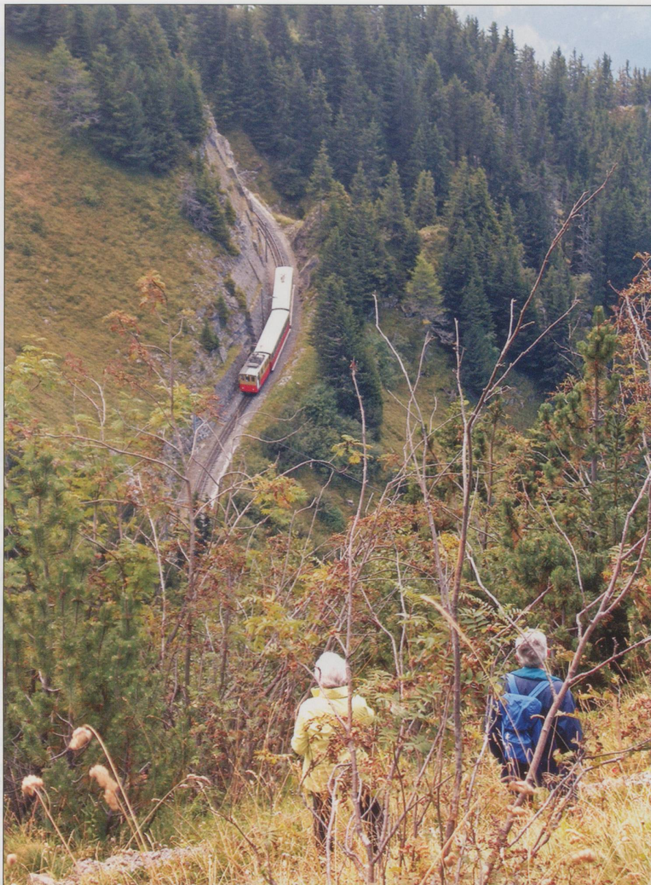
A Schynige Platte Bahn train heads down towards Wilderswil in September 2008.

Initially, there is not a lot to see on the trip as the line is in rock cuttings, followed by forest. Eventually the route is surrounded by rock strewn Alpine meadows with wandering cows, bells ringing out as they contentedly chew on the lush grass, completing the idyllic picture. One of the great advantages of the old rolling stock over more modern, panoramic trains is that the windows can be lowered, enabling photographs to be taken without the annoying reflections that have spoilt many images taken on trains with fixed windows. So, looking across the sloping meadows towards Interlaken and the lakes of Brienz and Thun laid out below, it is time to