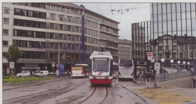
Be 4/8 No 32 at Bahnhofstrasse.