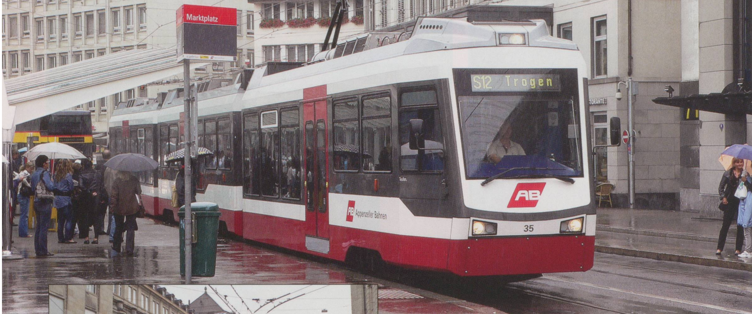
ABOVE: Be 4/8 No 35 at Market Place, St Gallen.

Jason Sargerson visits the Trogener Bahn