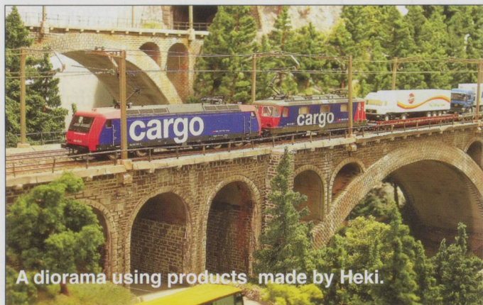
A diorama using products made by Heki.

T here are many good things happening in the railway modelling hobby right now. It is a very good time to start modelling Swiss railways in a number of scales and gauges. This article lists just a few of them.