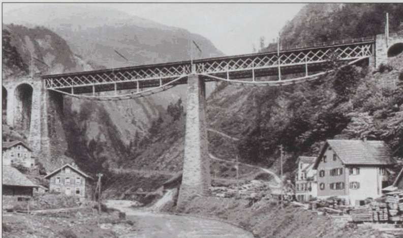
The Kerstelenbach Bridge after electrification.

My interest in Swiss Railways is focused on the Gotthard rolling stock from about the 1920's to the era of the Re 6/6 - a time when Swiss locomotives were green and had round headlights. Unfortunately I have no model railway to run these trains, mainly due to suffering from 'imagination construction' (it is at least easy to make changes) and my own expectation of the end result. The grand plan has always included a bridge as the focal point, which the Gotthard has in abundance, and I chose the Kerstelenbach Bridge on the north ramp at Amsteg. Completed by the Gotthard Railway in 1881 its final form, prior to being replaced in 1969, captured my imagination - the character of old world iron lattice construction has an individuality that some single span stone arches and welded steel beams lack.