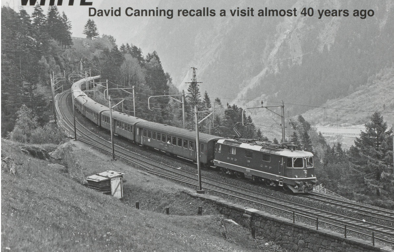
Wassen 20th Oct 1973.