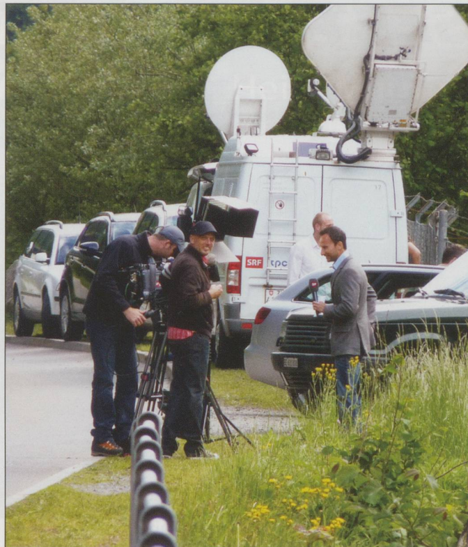
TV Crews at the rock fall.

“Replacement bus service” is three words that are certain to strike fear into the heart of any rail traveller. However, even knowing that the Gotthard line was blocked, my wife and I decided to travel from Luzern to Lugano for the day. We boarded the 08:20 from Luzern seated ourselves in its Panorama Car as far as Fluelen. On arrival there, and despite the sea of fluorescent vests, a certain amount of confusion reigned. The station car park was full of buses and coaches of all descriptions and despite being one of the first off the train and into the car park. We, along with most other First Class passengers, were shepherded onto a rural bus which was first in the line. Once the bus was full, other passengers were directed to luxury coaches located behind the bus, which then