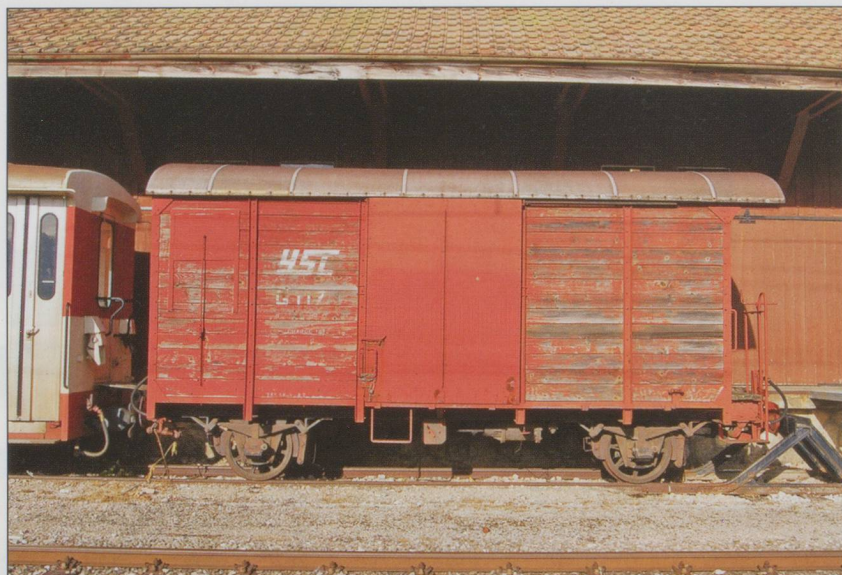
A goods van at Ste Croix 1.