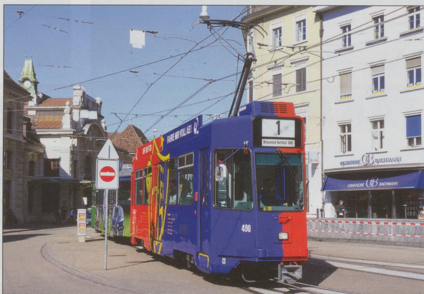
BVB Class Be 4/4 single car No. 490 was at the head of this Route 1 service recorded arriving at Bahnhof SBB.

Despite the infiltration of new Stadler units there is still a great variety of more traditional Swiss Standard combinations to be seen and enjoyed, as has been well documented previously in the pages of Swiss Express . Added to this, there were a number of units carrying non-standard liveries supporting advertising branding to be seen. While the purists may well frown on such practices, it gave me the opportunity to capture a selection of colour variations that provide a sample of what could be seen on the Basel network at the time of my visit. With a sizeable order placed with Bombardier for more new trams, the opportunity was not to be missed as I