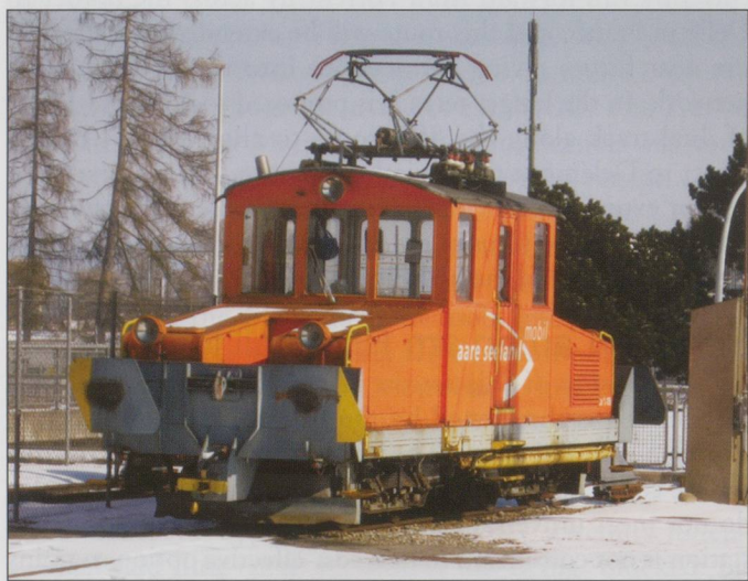
Ge4/4 No.126 at Langenthal in March 2010.

Ge4/4 No.126, a veteran of 1917 on the Aare-Seeland (ASm) system, used for the freight traffic on transporter trucks, has been part of the scenery around Langenthal for years. On June 22 she was taken away. However, she is in safe hands: the Railway Museum Kerzers/Kallnach has found her a place.