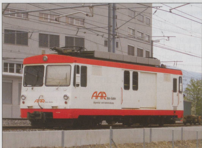
WSB De4/4 No.43 at Suhr with transporter bogies in April 2012.

Transports Publics Fribourgeois (TPF) has announced plans to build a new through station at Châtel-St-Denis to replace the current one, where all metre-gauge Palézieux-Bulle trains have to reverse. Works should commence in 2014 at a cost of CHF20m.