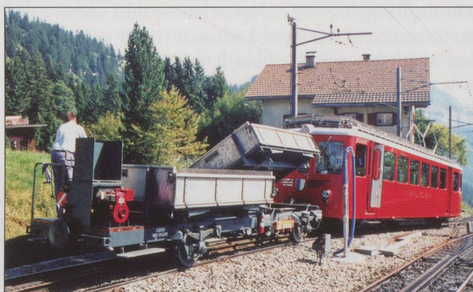
BELOW: Rigi No. 5 tipping building material at Kaltbad.