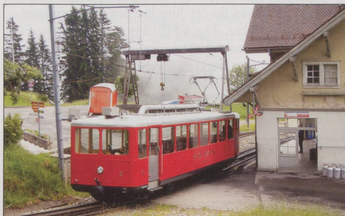
ABOVE: No 3 at Kaltbad - 21.06.09.

Special offer for SRS Members. If you would like the new 2012 Rigibahnen guide book, email your SRS Membership Number, name and full postal address with post code to info@rigi.ch . The book will be sent to you together with an exclusive Rigi Chocolate bar! This is in the form of Rigenbach's rack rail. This offer is valid until 31st May 2012, and is limited to one application per member.