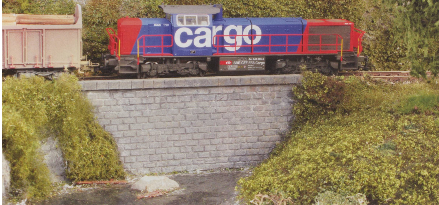
A Piko SBB Cargo Am 843 standing on top of a 2 inch raised track bed with painted and weathered Heki retaining wall.