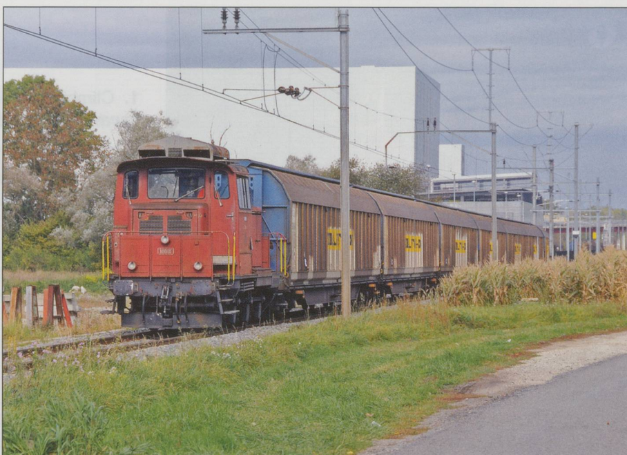
TOP: On a dull, wet Sunday in October 2012, SBB Cargo Re4/4" 11258 heads north through Neuchâtel with the Chavornay to Avenches Nespresso vans.