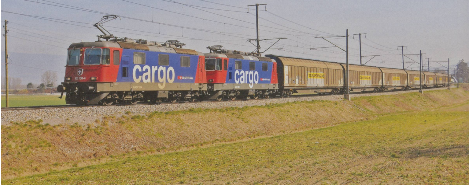
SBB Cargo branded Re4/4" (Class 420) pairing 420 160 & 420 268 add a splash of colour to the front of the Avenches-Chavornay van train seen near Ependes in March 2009.

W e start with a question: "What word links the film star George Clooney with SBB Cargo, the freight division of Swiss Federal Railways?" The answer is Nespresso, the brand name of the Vevey based Nestlé Group's premier coffee capsules, the sales of which have enjoyed massive growth globally during the last decade or so. The Nespresso story began in 1976, when Nestlé invented, patented and introduced their innovative system, albeit with little initial success. By the 1990's, sales were growing and by 2001 the Nespresso Production Centre at Orbe, near Chavornay in Canton Vaud was operational, providing a production capacity of three billion capsules annually. Being rail connected, a sizeable proportion of both green coffee