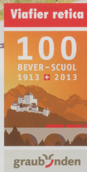
Logo - courtesy of RhB

The electric loco parade was scheduled to take place on the Saturday evening at Bever, starting at 21:50 after the departure of the last scheduled train. Unfortunately the day had been cold and wet, but there was a good crowd entertained by music as they awaited the start of the loco parade, whilst the beer tents were doing good trade! Alan and Tony were amongst quite a crowd of photographers stationed on the goods platform, out of the rain and hoping for a good view. Unfortunately for them, a four-car Allegra unit arrived and disgorged the official party who took over the sheltered vantage point. Alan, Tony and the others were then allowed to stand on the running track platforms behind some barrier tape. At 22:00 a large screen situated at the far side of the station started a presentation that described