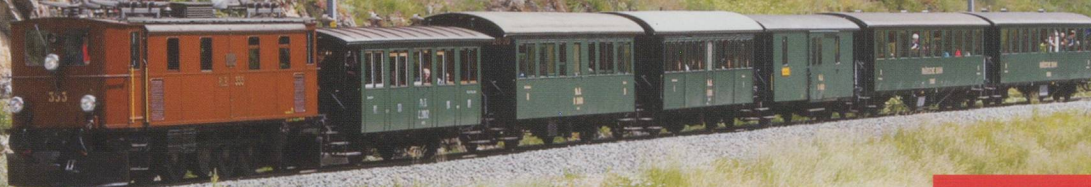
Ge 4/6 No.353 with a vintage set of coaches.