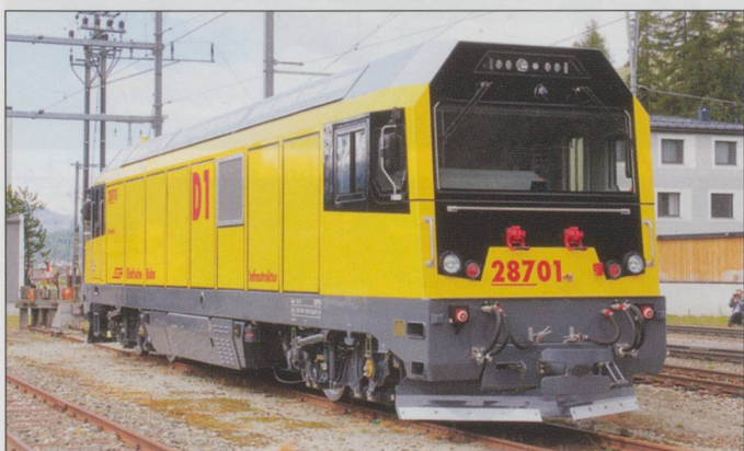
TOP: Ge6/6I No.414 brings the "Alpine Classic Pullman" from Samedan heading to Scuol. There was no supplement for travel over the weekend.