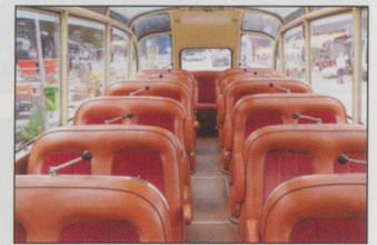
Saurer L4CT2D, controls and interior.