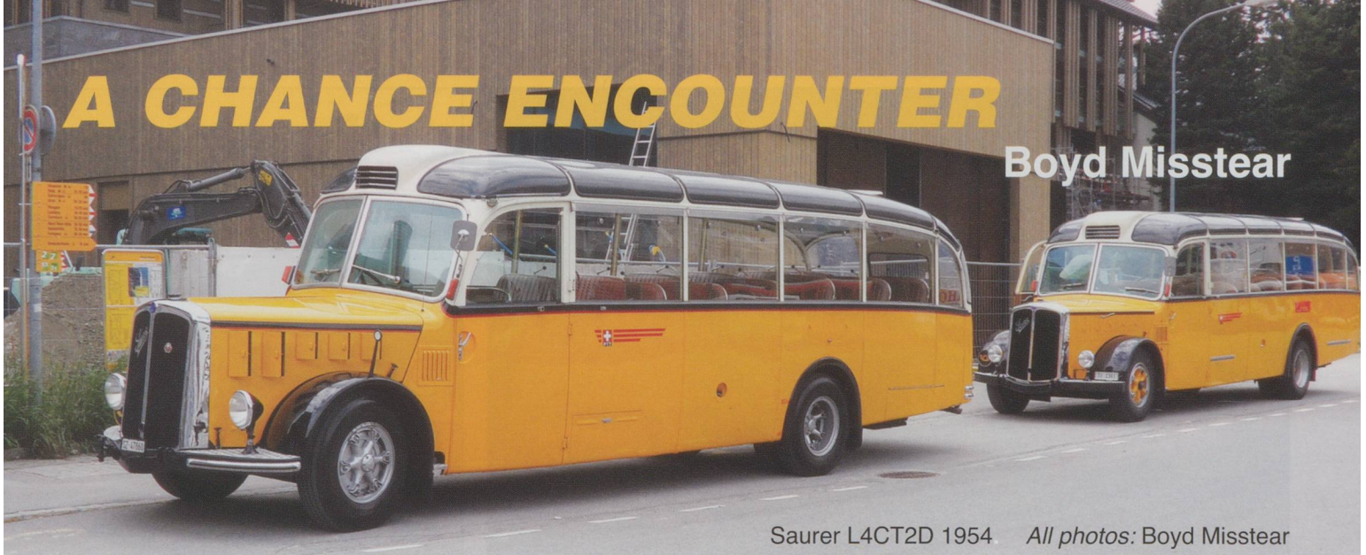
Saurer L4CT2D 1954

As so often happens in life, a chance meeting triggers an interest. In this instance, while alighting from a Matterhorn Gotthard Bahn InterRegio service in Andermatt in July 2013, I happened upon two preserved PostAutos. Approaching one of the drivers I asked if I could take some photographs. While regretfully neither of us could communicate coherently in a common tongue, he was very helpful, and I spent a few minutes being shown over one of the two vehicles – both classic 1954 Saurer Autopostale Alpenwagen L4CT2Ds. These are part of the fleet of Barenco & Andreoli of Faido, a company who have celebrated 133 years of service 1880–2005 under their motto “In viaggio con voi” – “travelling with you”. The right-hand driving position was adopted in this generation of PostAutos to help drivers accurately assess how close to the edge of (then un-barriered) mountain roads they were travelling. Compared to current vehicles there is a cozy closeness between the upholstered seats, and on a warm summer’s day they were exuding the distinctive rich aroma of fine leather. Apart from the Saurers owned by the Faido company, there are many others preserved and available for hire in Switzerland details of which can be found through the Saurer Old Timer Club ( www.saurerold-timer.ch ).