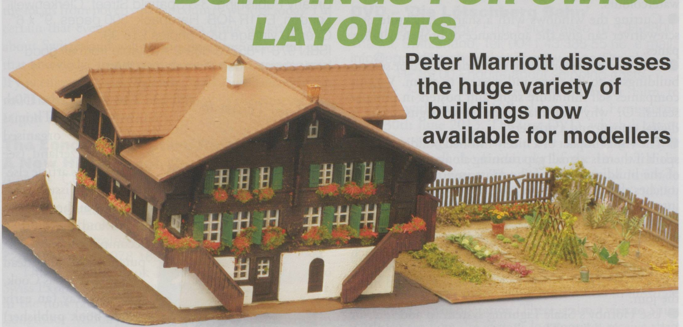
An Emmental farmhouse (a plastic kit by Kibri) with a handmade garden along side.

Peter Marriott discusses the huge variety of buildings now available for modellers