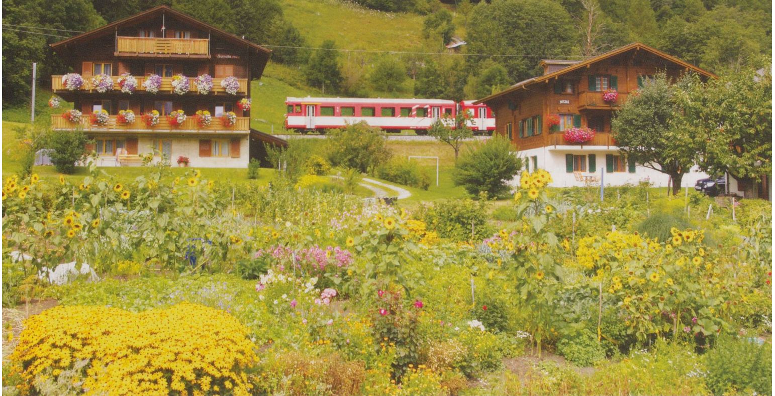
Westbound MGB train led by an unidentified ABt approaching Fiesch passing behind houses and gardens on the eastern side of the village.

Having decided to stay in Brig for the weekend of the BLS Grosses BLS-Südrampenfest, and being able to make it a long weekend as I had a few days vacation left, the question was what to do on the Monday. As the weather forecast was good, I decided to do some lineside photography on the ex-FO section of the MGB. Having scoured Brig for a good walking map, and seen how many sections were almost inaccessible from walking paths, I headed for Fiesch with the aim of walking (downhill!) to Grengiols. My plan to travel the cable car up the Eggishorn was ruled out by low cloud which, while clearing over the valley, was stubbornly clinging to the mountains. After a coffee and a quick visit to a supermarket for the makings of lunch, I first headed eastwards only to find that the curve above the town was completely obscured by trees. However, I was able to get a shot of a train between two houses across a colourful garden. My route down to Lax confirmed the view I had from the morning's train journey, that the line was tucked too far into the side of the valley to be very visible. So, apart from some shots of the scenery along and across the valley, my next railway photographs were of local trains at Lax station where I also photographed a PostAuto on a service that calls there once each way per day – I'm sure there is a good reason!