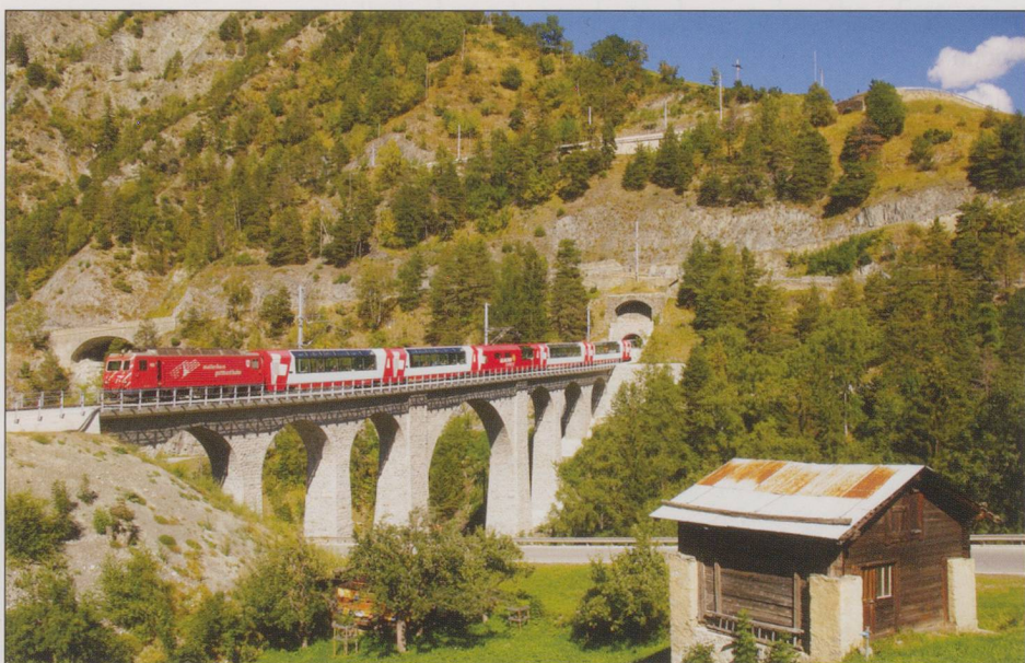
TOP: MGB Deh4/4II No. 93 with east-bound train on Grengiols river bridge - viewed from the hill above the bridge.