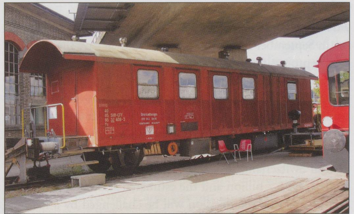
Support wagon at the Bahnpark roundhouse in Brugg.

It has been announced that following establishment of a finance plan, all three locomotives, G3/4 No.208, HG 3/3 No.1067 and No.1068, will be restored after the depot fire in November 2013. No.208 is expected to be serviceable in 2015, while No.1067 will be ready in 2016 and No.1068 will follow. The last loco had not run for 40-years having been on a plinth in Meiringen.