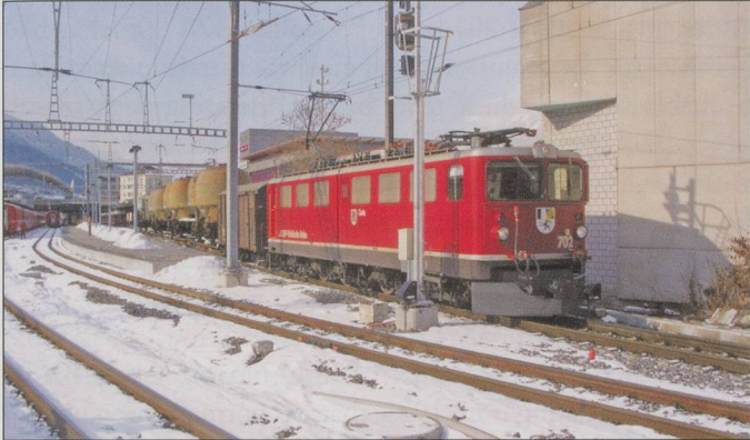
Now withdrawn RhB Ge 6/6 No. 702 at Chur when still in regular service.

finally delivered by July 1964. When still new in December 1963 No.11201 was severely damaged in a fatal accident in Oberwinterthur so did not reappear until October 1964. By this time the series was renumbered as Nos.11101-6 and these became the pre-cursors to the biggest series of locos (built over a 15-year period) that Switzerland has ever seen - the Re4/4 II and Re 4/4 III. Although the ranks are slowly thinning many of these will still run for some years.