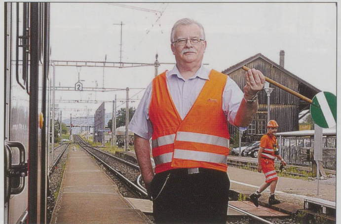
The last station master?

Following many complaints from passengers in Canton Aarau, particularly in Baden, that it was difficult to distinguish between local and longer distance buses, the cantonal transport co-ordinating organisation 'A-Welle' has announced that participating transport companies may retain their own identity and are no longer required to spray their buses or trains in the 'A-Welle' colour scheme. So far only PostAuto has reacted positively to this news noting that none of their buses will be resprayed, but all new vehicles will appear in the PostAuto livery.