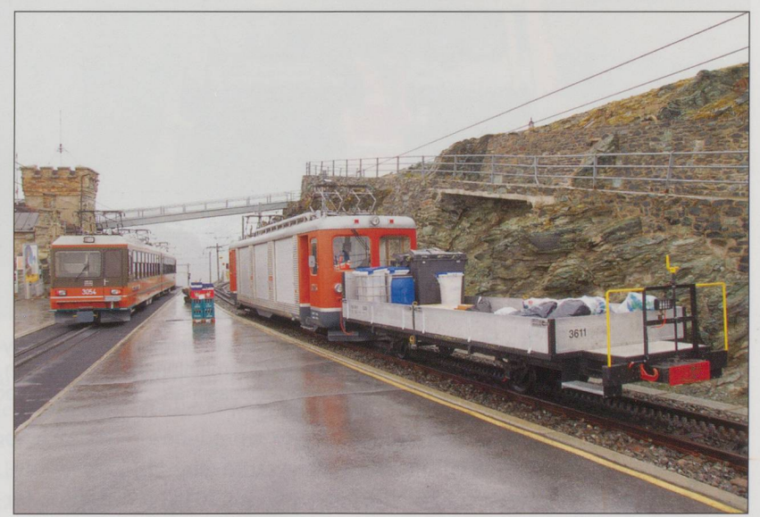
Dhe 2/4 and trailer with hotel supplies at Summit Staion.

Swiss Tip Good ideas and information about Switzerland from travellers.