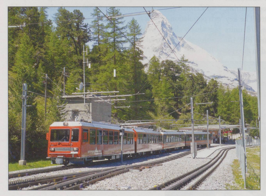
TOP: GGB Bhe 4/6 No. 3081 waits at Gornergrat Station ready to return to Zermatt.

MIDDLE: A 4-car set waits for its returning passengers. BOTTOM: The picturesque setting of Riffelalp station.