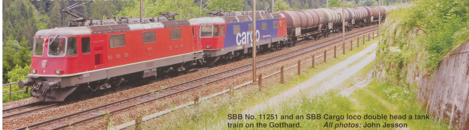
SBB No. 11251 and an SBB Cargo loco double head a tank train on the Gotthard.