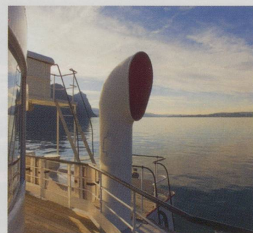
Glacier Express Packages - Tickets/Reservations Scenic Rail Journeys - Switzerland Tailor made Lakes & Mountains Experience Packages Ask for one of our brochures.