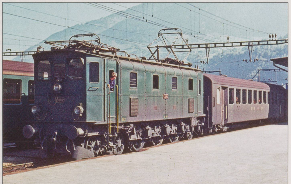
Local train, 1967 style. Ae 3/6III 10262 awaits the rightaway at Brig.

The Swiss portal, about 1.5km beyond Brig station, is at an altitude of 686m. A rising gradient in the tunnel, for drainage, takes the elevation to 705m before dropping to 633m at the Italian portal located just under 1km from