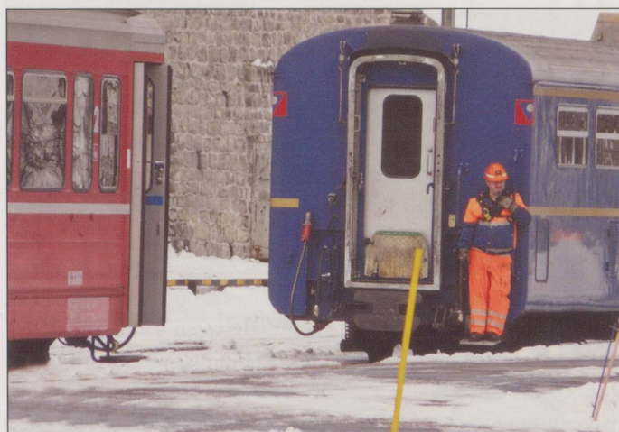
At St Moritz, Ge4/4III No. 643 reverses towards its train, pushing a Gourmino dining car. The shunter contemplates the last few moments before the buffers meet.

Chris Chick looks at some Swiss shunting procedures