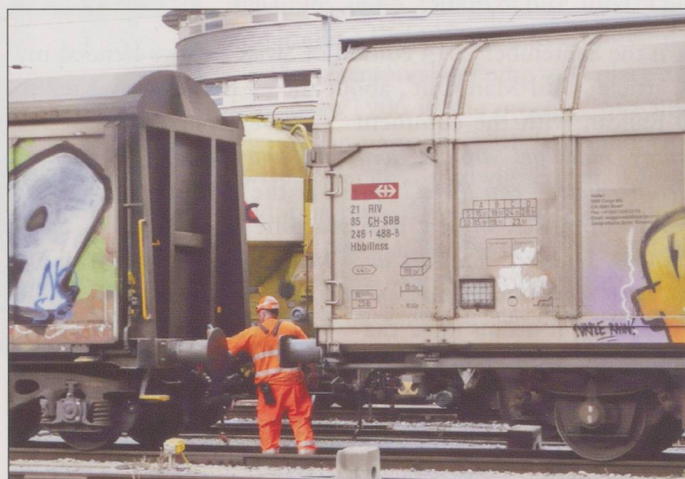
At Luzern, the wagon on the right is stationary. The one on the left is moving towards the shunter who is standing between the rails!!

Arriving in St. Moritz on a Bernina line train on Christmas Day 2012, I stepped out onto the platform to see a Ge4/4 III locomotive reversing a dining car towards a train waiting at platform one. The shunter was standing on a small platform on the end of the dining car. My camera was quickly switched on and set to maximum zoom, so the resulting photos are not the best of compositions but they show the procedure that was probably repeated each day. It might have been Christmas Day, when nothing moves on U.K. railways, but in Switzerland life goes on as normal. This method of operation is presumably standard approved practice, as the little fold-down platforms seem to have been added since the coaches were originally