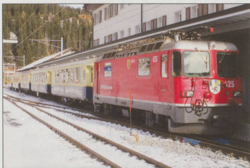
ABOVE: Ge 4/4 II 627 has been added to the fleet of 100 year liveried locomotives and celebrates the Chur-Arosa centenary.*

The 'Alpine Classic Pullman Express' had Pullman Cars formed this service which also ran two daily returns was hauled by No.625. This train was naturally very popular. It included the famous piano-bar-car and was a superb way to enjoy the Arosa line.