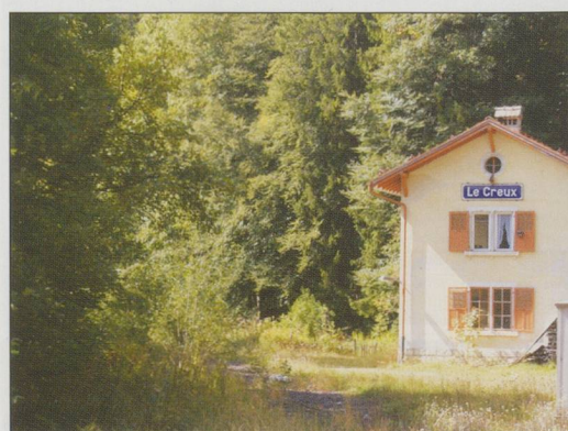
Le Creux. The station closed in 1888 but still maintained near La Chaux de Fonds.

An interesting closure case has disappeared almost without trace. The first line of the SCB, opened in 1857 from Olten to Bern, ran into Bern Wylerfeld, on the east bank of the Aare gorge, as there was no bridge and in 1859 the SCB's line to Thun was built from a junction at Wylerfeld. In the meantime, the first bridge at Bern allowed the line to be extended from Wylerfeld to the original Bern HB in November 1858. Finally in 1912 there was a complete realignment from Münsingen to Ostermündigen, via Wankdorf where the junction is today. The direct line south from Wylerfeld has disappeared, except at Ostermündigen where sidings with a facing