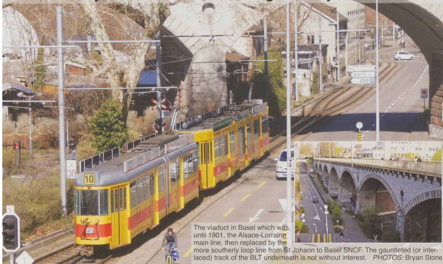
The viaduct in Basel which was, until 1901, the Alsace-Lorraine main line, then replaced by the more southerly loop line from St Johann to Basel SNCF. The gauntlet (or interlaced) track of the BLT underneath is not without interest.