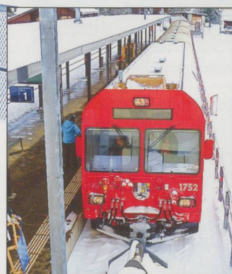
The arrival of a sledge train at platform 1 in Bergün-Bravuogn.

Every winter the 6km of winding road that runs down from Preda to Bergün is closed to traffic during the day and becomes one of the longest publically accessible sledge runs in Europe – and it's floodlit six nights a week! Key to the operation of the run is the shuttle-service of trains between the two stations provided by the Rhätische Bahn. If people have not brought their own sledges, toboggans, etc. they can be hired (from CHF12/day) in Bergün, where all the participants make their way to the station. Here they load their equipment onto to the Schlittelzug, a special