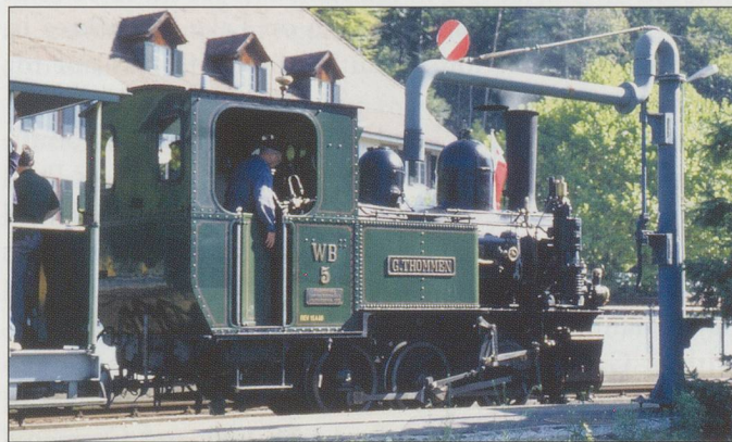
ABOVE: WB No 5 at Bad Bubendorf. BELOW: WB train in 1/11/1970 before the line was closed.