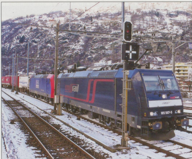
Double header Crossrail train.

A majority shareholding in Crossrail of 50.1% has been bought by German organisation Rhenus AG. Crossrail, with headquarters at MuttENZ (Basel) marshalling yard, operates a frequent service of container trains mostly over the BLS route, including some which take the old line through Kandersteg. Their locomotives are a familiar sight on trains, and in Brig, Spiez and Thun for banking and double heading. Crossrail has recently opened an operations centre in Brig, from which out-and-back workings to Basel and Milano/Novara are possible, and has some 60 drivers based there.