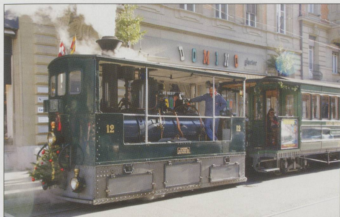
Above, steam tram No.12 in Bern and below the driver's eye view of the controls and the road ahead.

1950 as reserve on the Stansstad – Engelberg railway. In 1902 No.12 went to a sawmill in Biel, and from 1943 it was stored for an SBB museum. It was then exhibited at Technorama in Winterthur and it also ran from 1971 to 1983 on the Blonay-Chamby Museum Railway before returning to Bern.