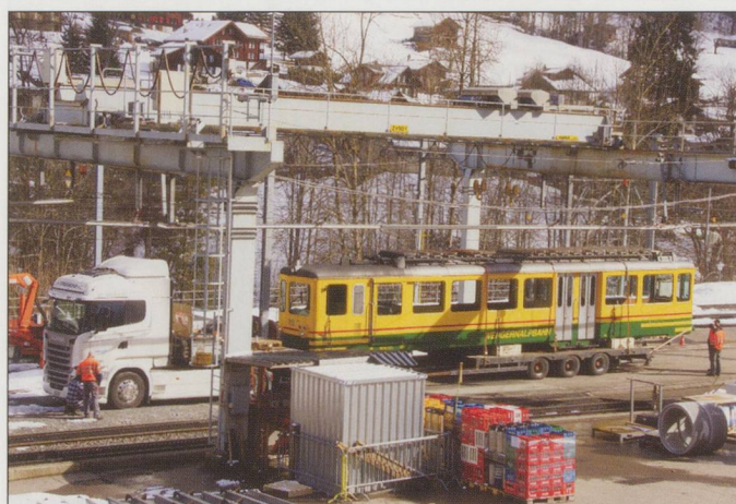
WAB 119 on low loader at Lauterbrunnen Photo: Abtransport

At Lauterbrunnen on 5th March WAB BDhe 4/4 No.119, stripped of useful bits, was loaded onto a truck for its last journey - to the scrapyard. Nos.101, 107, 109, 119 and 124 are also taking this road, whilst No.102 was scrapped last year. No.109 was still in action at the station, but reprieves are short.