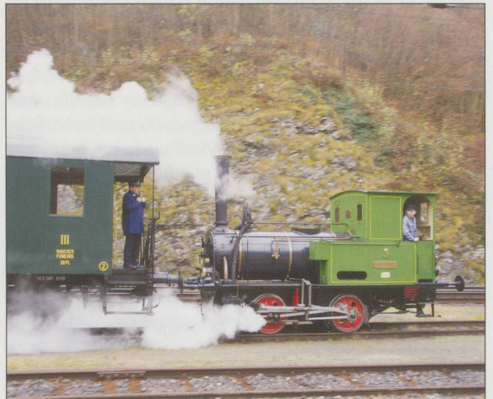
Locomotive 'Zephir' at Choindéz station. (2)

Over the past winter SBB Historic has moved its archive and offices from Bern to Brugg. This move is planned to be celebrated in Brugg, together with 'Bahnpark Brugg', on 31st May when a programme of special trains will operate through the day with Eb 3/5 No.5819 from Brugg station. Also this year two more trips are planned using 1874-built E 2/2 'Zephir', a survivor of the Bödelibahn the first railway in Interlaken. These will be on 26th Sept. and 10th Oct. in conjunction with a conducted tour of the Delémont roundhouse of SBB Historic and Historische Eisenbahn Gesellschaft, and a return trip to Choindéz for a visit to the Von Roll museum of the one-time ironworks located there. Your correspondent enjoyed a similar trip behind 'Zephir' last December.