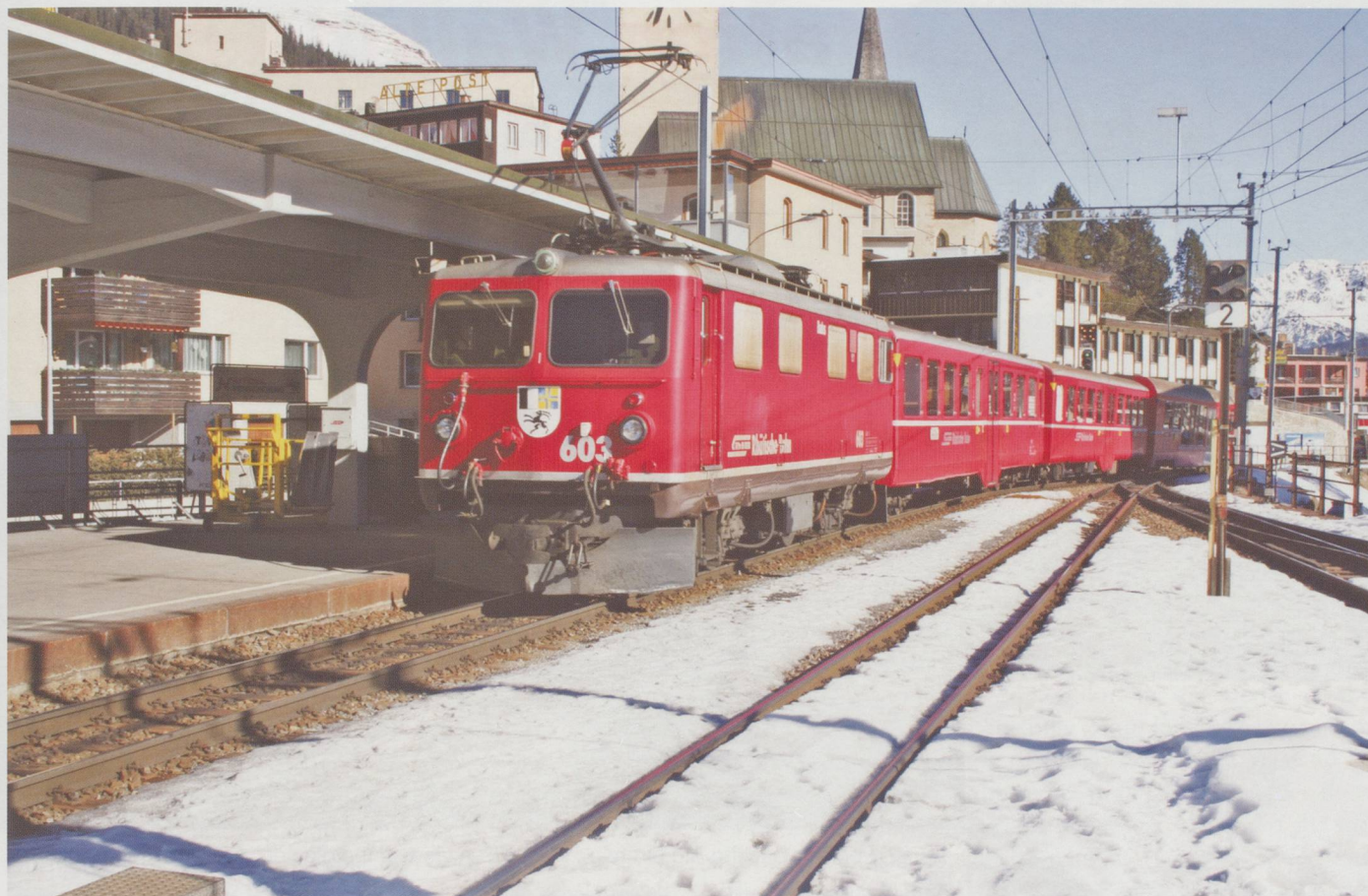
RhB Ge4 4 I 603 arrives at a snowy Davos.