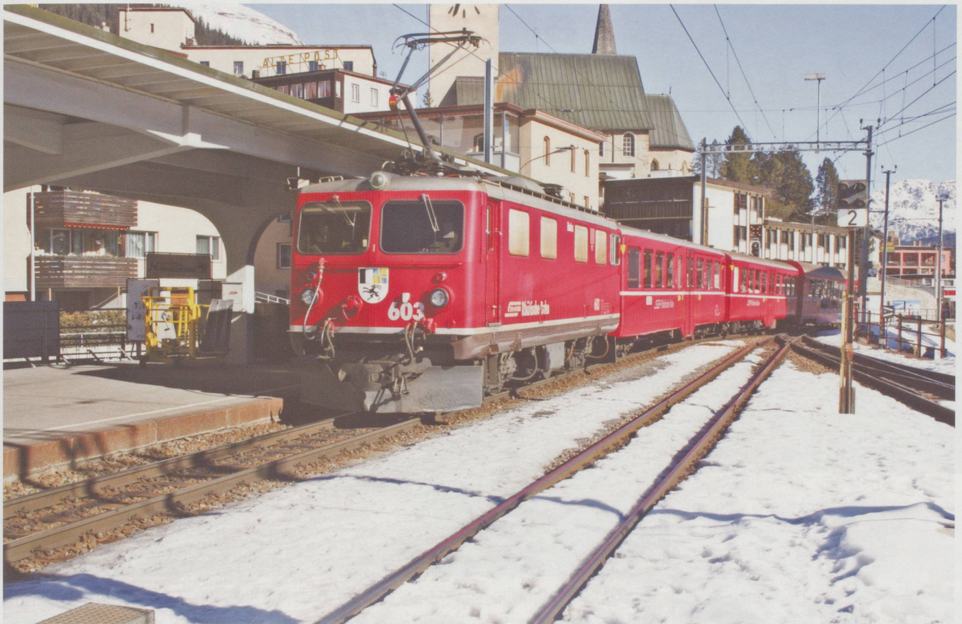
RhB Ge4 4 I 603 arrives at a snowy Davos.