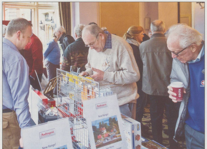
ABOVE: Right Priorities - coffee first then model buying.