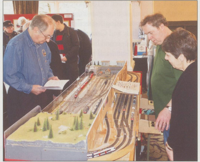
ABOVE: Layout watching.