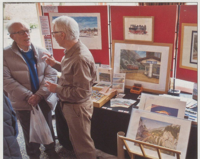
BELOW: Discussing art!