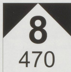
A representation of the gradient board at Mühlenen. The line is shown to rise at 8‰ for 470 m.