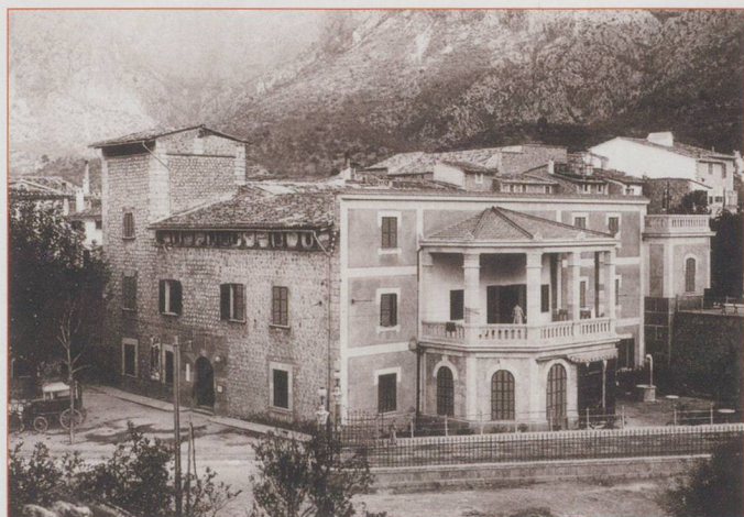
Soller station front. The house as was, but changed to become the station with the booking office, etc. inside.