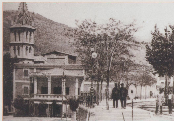
Soller station platform. Back of the house now the station with one platform. The veranda is now a cafe.

First off the mark to challenge this was Geoffrey Bryson who noted that his 1993 edition of 'The Guinness Book of Railway Facts and Feats' , listed Cuautla, south of Mexico City, as having the world's oldest railway station. The Mexican station was originally built as a convent in 1657 until it was secularized in 1812, then becoming a station when the railway was opened in 1860. In its original use the building was catering for the needs of New World Catholic women for 33 years, before Old World Swiss Catholic men could go to Grafenort on holiday! It also had seen 38 years of use as a station before the LSE's predecessor the Stans Engelberg Bahn opened its facility in the Herrenhaus in 1898.