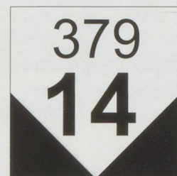
A representation of the gradient board at Le Brassus station. The line falls at 14‰ for 379 m