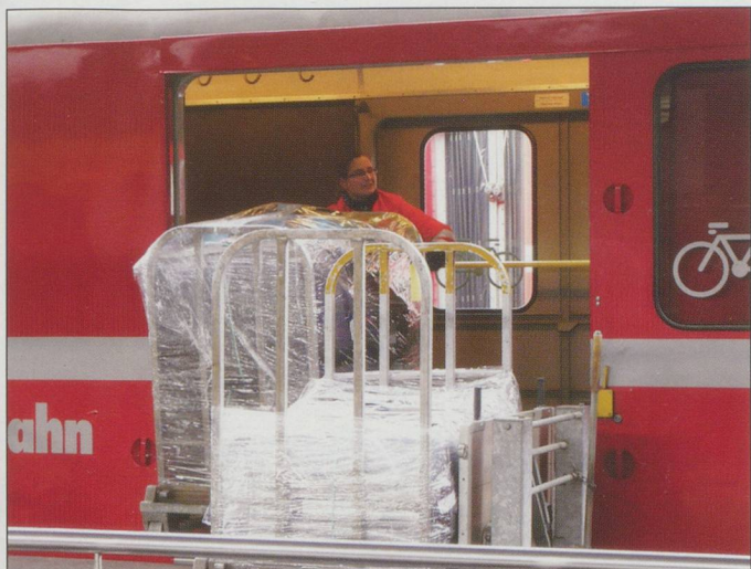
A second trolley is pushed out on to the cart.

seen in use on the RhB and I collected some images of them in use when at Bergŭn and Chur in December 2012. The article also brought to mind the way in which various post and baggage carts bring character to station platforms.