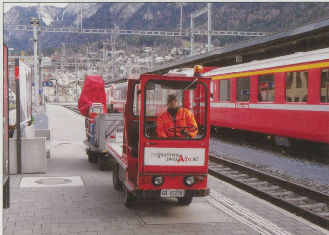
ABOVE: This little battery powered tractor at Chur station seems to be pulling a trailer of catering supplies for loading on to a train.

BELOW: This cart was seen at Poschiavo in December 2012. The improvised raised platform is presumably to achieve height alignment for loading.