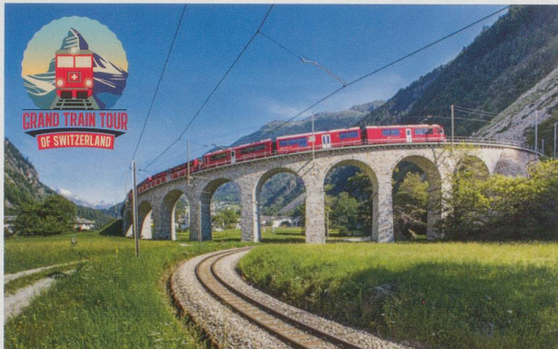
GRAND TRAIN TOUR OF SWITZERLAND

NEW Grand Train Tour Discover the exhilarating 7 night rail holiday taking in the best rail journeys in Switzerland