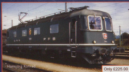
RC72584 SBB Re6/6 Electric Locomotive IV