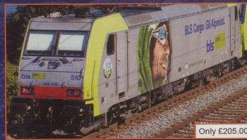
RC73651 BLS Cargo Re486 Electric Locomotive VI