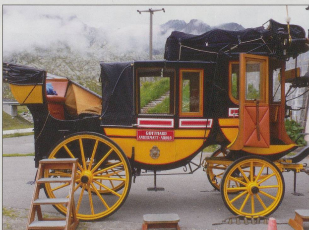
RIGHT: The carriage used now for tourists. LEFT: A depiction of the dangers faced by travellers back in the day.