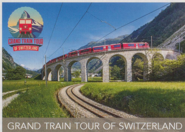
GRAND TRAIN TOUR OF SWITZERLAND