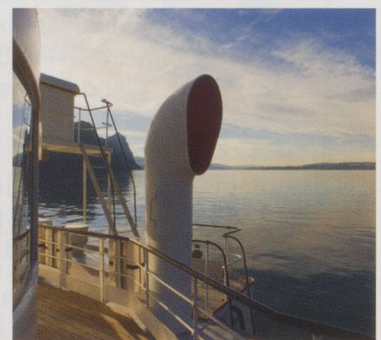
Glacier Express Packages - Tickets/Reservations Scenic Rail Journeys - Switzerland Tailor made Lakes & Mountains Experience Packages Ask for one of our brochures.