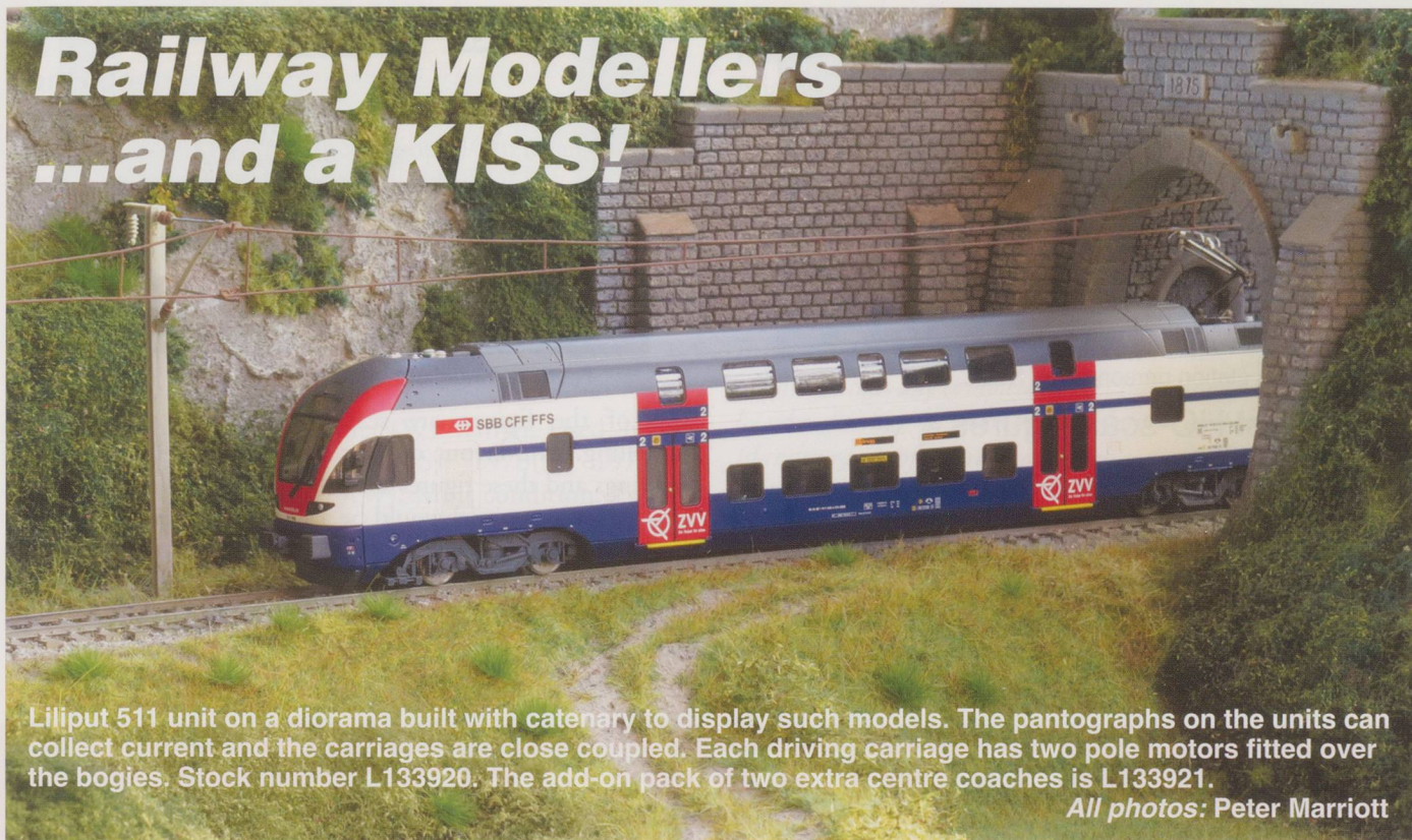
Liliput 511 unit on a diorama built with catenary to display such models. The pantographs on the units can collect current and the carriages are close coupled. Each driving carriage has two pole motors fitted over the bogies. Stock number L133920. The add-on pack of two extra centre coaches is L133921.