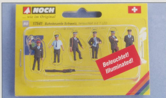
Swiss station personnel by Noch.