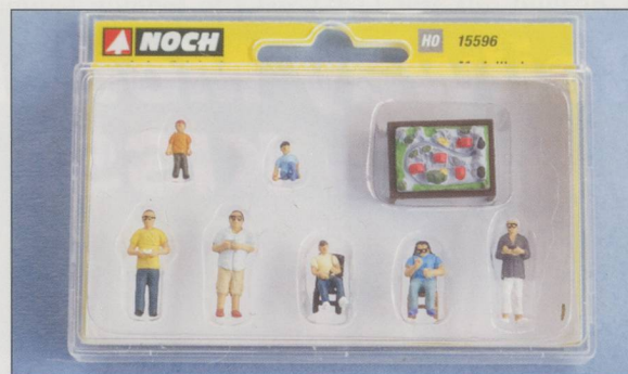
Railway modellers by Noch!

Noch is well known for producing a large range of figures for modellers in all of the popular scales but these two packs are a little different. One is a set of railway modellers and the other is of Swiss station personnel, one of whom carries an illuminated train despatch disc. There are seven railway modelling figures including two children. Four of the figures are wearing glasses and three of them are holding controllers.