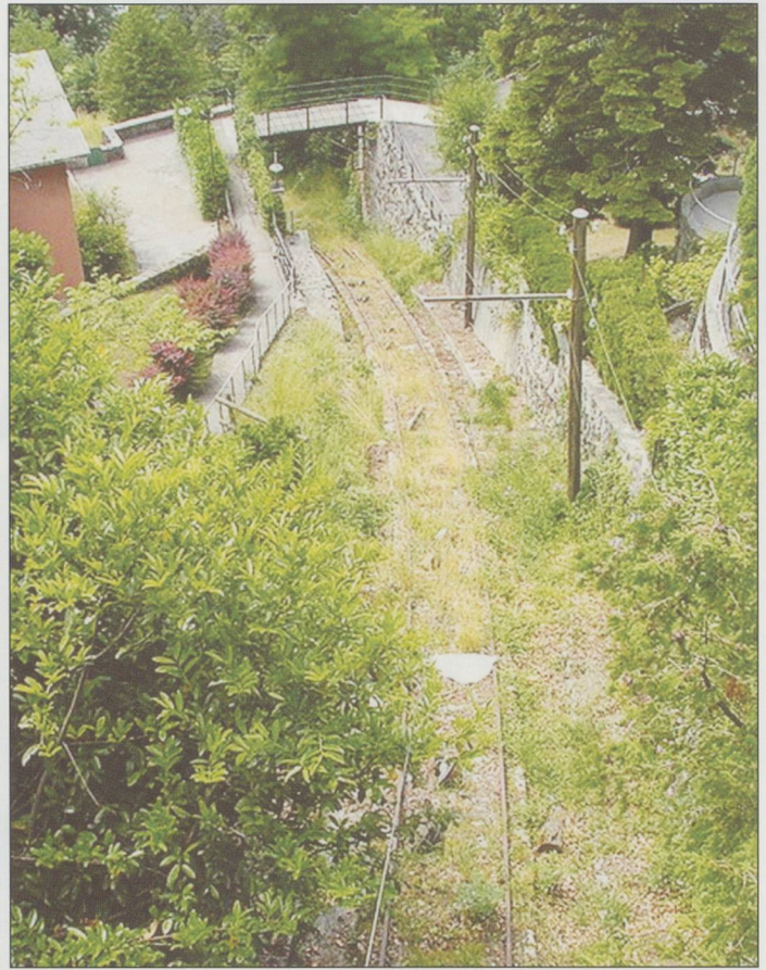
Territet entrance of Mont Fleuri Funicular on 31/3/2005. M.Farr